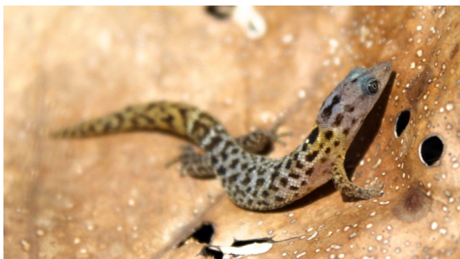
Fig. 2. An adult Inagua Sphaero ( Sphaerodactylus inaguae ) from Great Inagua Island, Bahamas.

The introduction of alien flora and fauna has been widely recognized as detrimental to native species (Clavero