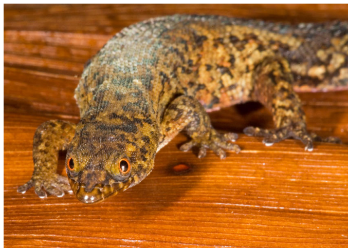
Fig. 1. An adult female Puerto Rican Upland Sphaero ( Sphaerodactylus cf. klauberi ) from the Guilarte State Forest.

We found a communal nest of S. cf. klauberi at 1630 h on 4 July 2015 in the trunk of a Mango Tree ( Mangifera indica ) in a shaded area at the edge of Secondary Road 135 between Villa Pérez and Adjuntas, Puerto Rico at 568 AMSL (Fig. 3A). This area is part of a secondary anthropic forest that is highly disturbed by traffic and extends onto the slopes southwest of Cerro Don Quiño and north of Río Guilarte. We found one unhatched egg in addition to three hatched eggs and many eggshells covered by loose bark approximately 1 m above the ground (Fig. 3A–B). The intact egg contained an embryo (approximate embryonic stage 32, using the staging