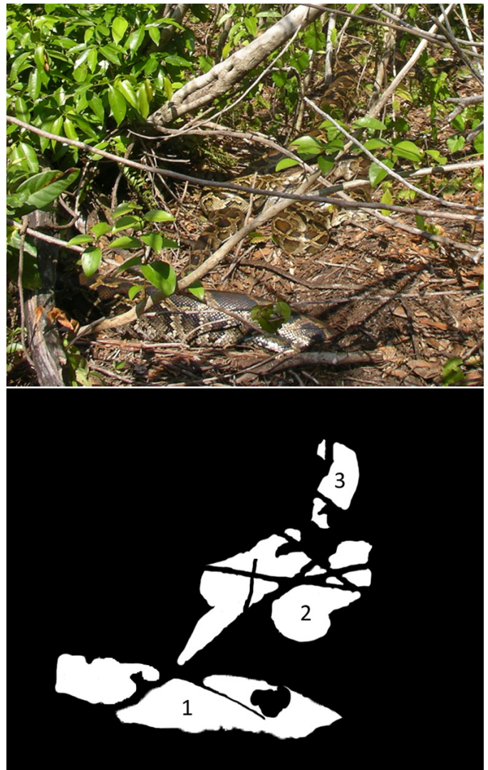
Fig. 3. (A) Photograph of the Burmese Python ( Python bivittatus ) breeding aggregation discovered in Everglades National Park on 17 March 2006. The three above-ground pythons are visible. (B) Black and white outline showing the location of the three above-ground pythons in the photograph.

The discovery of these eight pythons represents the largest documented breeding aggregation in wild Burmese Pythons and the first ever documented in invasive pythons. Researchers in Hawaii have used radio-telemetry to track feral goats ( Capra hircus ), allowing them to detect and remove additional goats, and researchers term this the “Judas” technique (Taylor and Katahira 1988). Our data suggest that this method can also be used to help detect and remove Burmese Pythons in southern