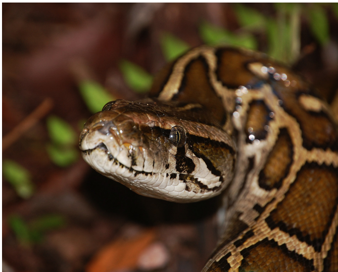
Fig. 1. Burmese Pythons ( Python bivittatus ) are an established invasive species in southern Florida, where they negatively impact native wildlife through predation and competition for resources.

ENP is a 0.9-million hectare U.S. National Park located on the southern tip of Florida. Habitats vary, but the park is predominantly wetlands, including freshwater and saline glades, and one of the largest mangrove ecosystems on Earth (e.g., Meshaka et al. 2000). We began our pilot radio-tracking study in the Pa-Hay-Okee region, which is dominated by freshwater glades and a large hardwood hammock. Between 6 and 8 December 2005, we captured four Burmese Pythons (3 M, 1 F), and on 9 December 2005, we surgically implanted each python with two VHF radio-transmitters (Holohil Systems, Ltd., Ontario, Canada). We used two models, SI-2 (11 g, nine-month battery life) and the AI-2 (25 g, 12-month battery life). They did not exceed 0.1% of any python's body mass. The transmitters were implanted intraperitoneally following standard methods (Hardy and Greene 1999, 2000; Reinert and Cundall 1982; Weatherhead and Anderka 1984).