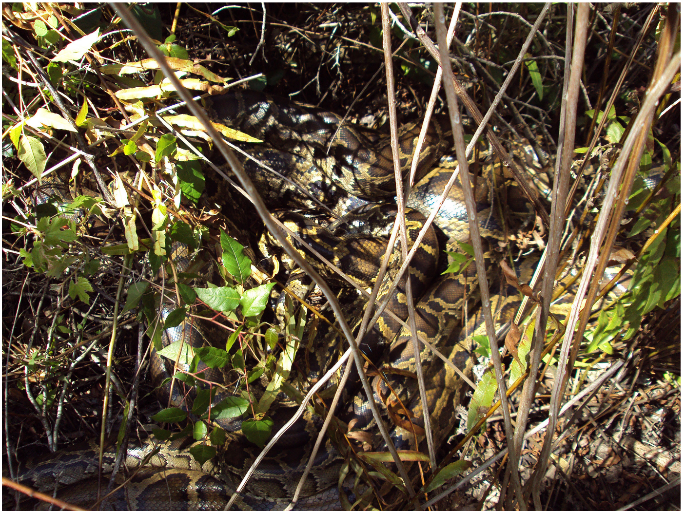
Fig. 4. Photograph of an in situ breeding aggregation of Burmese Pythons ( Python bivittatus ) discovered in March 2010. The aggregation of five pythons (4 M, 1 F) serves as an example of a large aggregation of invasive Burmese Pythons.

Florida during the breeding season. A single female Burmese Python from Florida may have as many as 87 eggs (Krysko et al. 2012), so using males to locate and remove reproductive females could be highly beneficial to control populations of this invasive species. In subsequent years, more breeding aggregations of Burmese Pythons in Florida have been discovered (e.g., Fig. 4). Efforts are underway to develop this tool, and future research will reveal more about the potential utility of exploiting breeding aggregations of Burmese Pythons via radio-telemetry and the Judas technique.