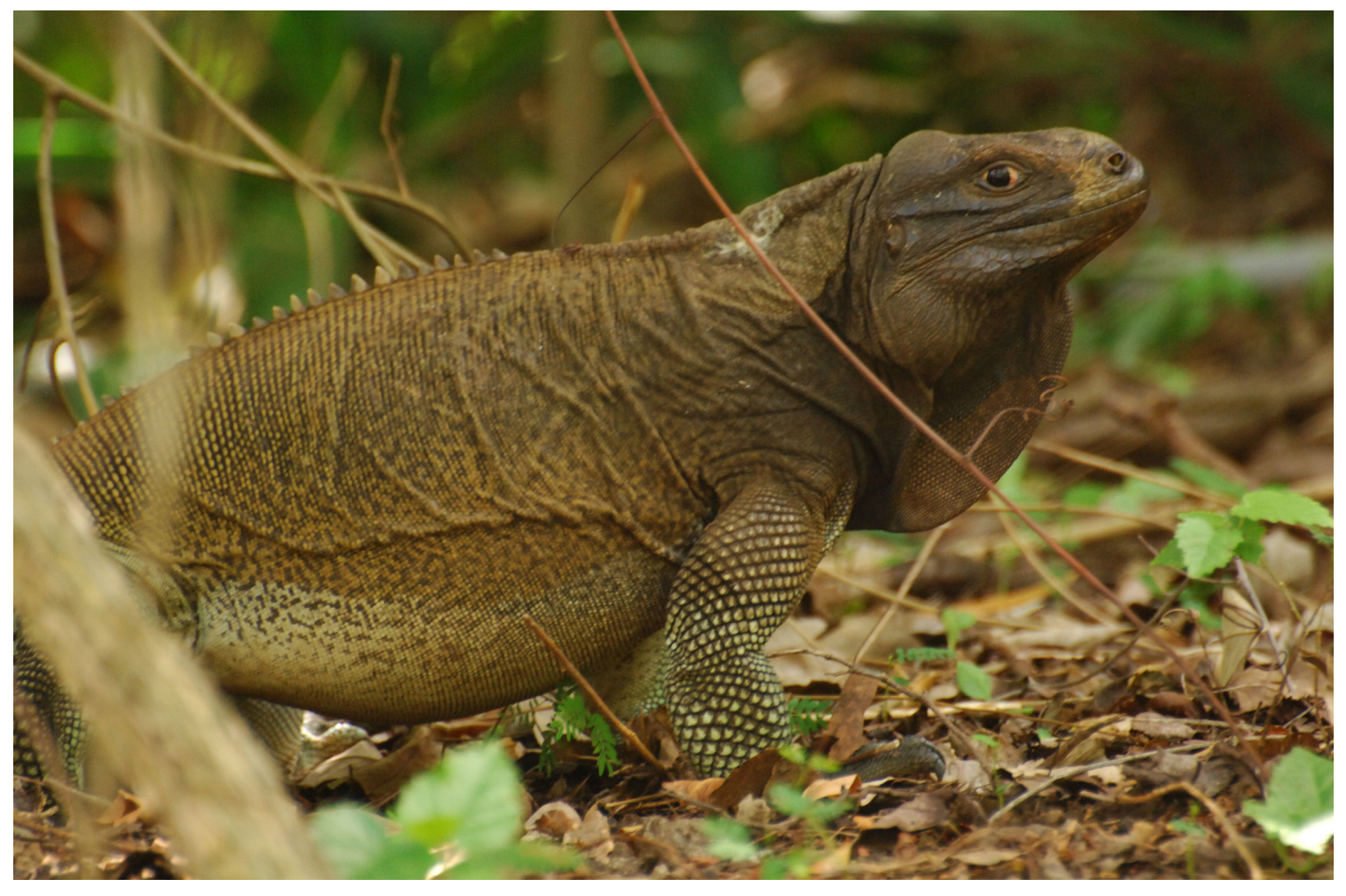
Fig. 1. Adult Stout Iguana (Cyclura pinguis).