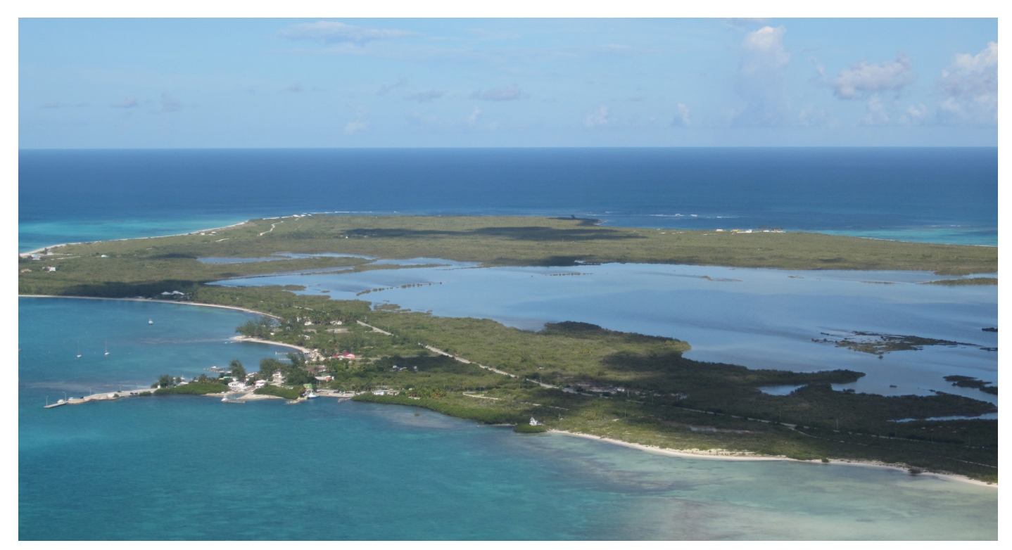
Fig. 2. Aerial photograph of Anegada Island.