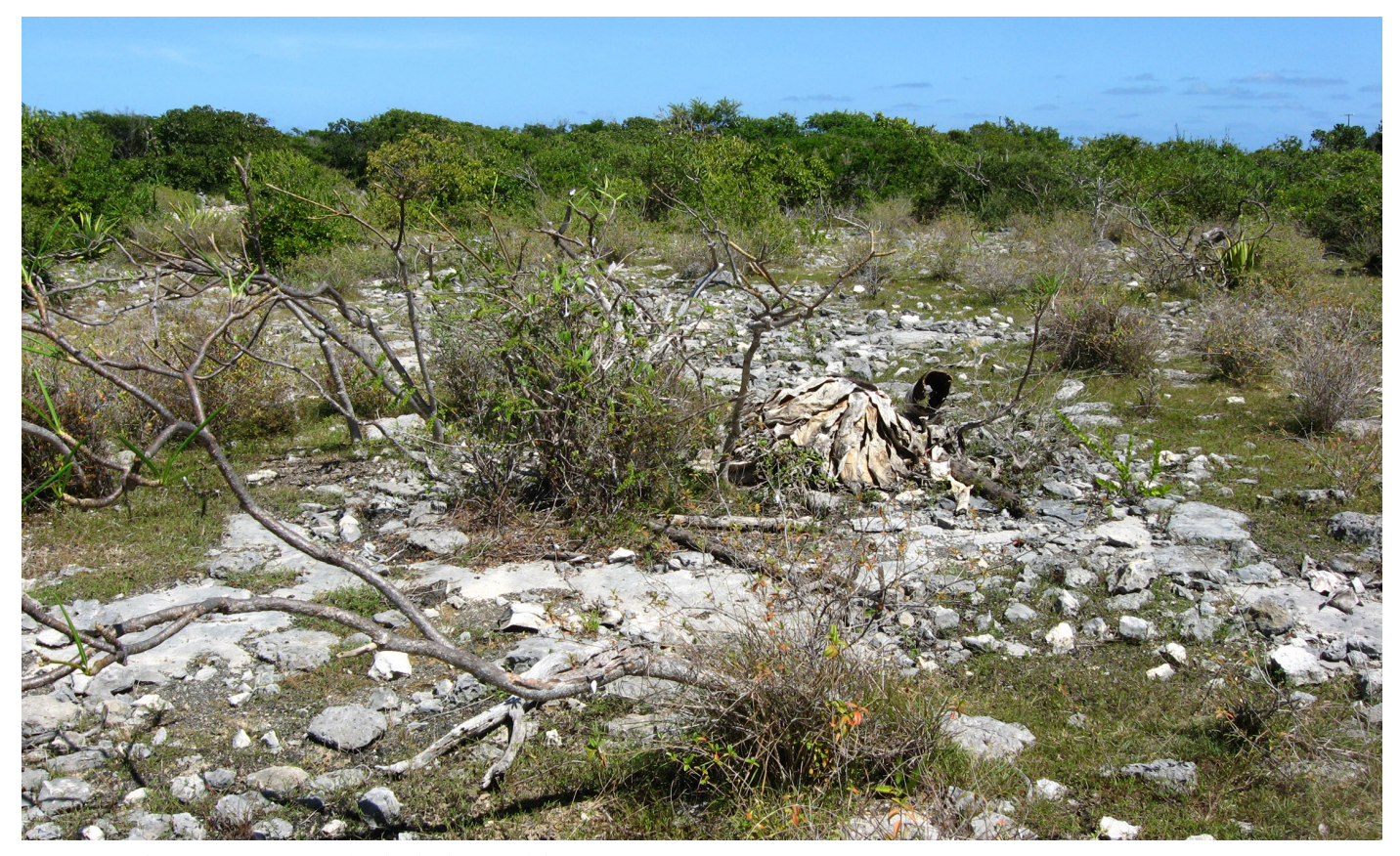
Fig 5. Typical Vegetation on Anegada Island.

We tested for differences in observed height on vertical structure used between juvenile and adult iguanas with a Wilcoxon rank test and used a two-sided Fisher's exact test to assess differences between adults and juveniles in the types of vertical structure used. Means are given \pm one standard error. Data were analyzed using software R version 2.15.1 (R Development Core Team 2008). All use of live animals was conducted under Texas Tech University Animal Care and Use Protocol 10068-09.