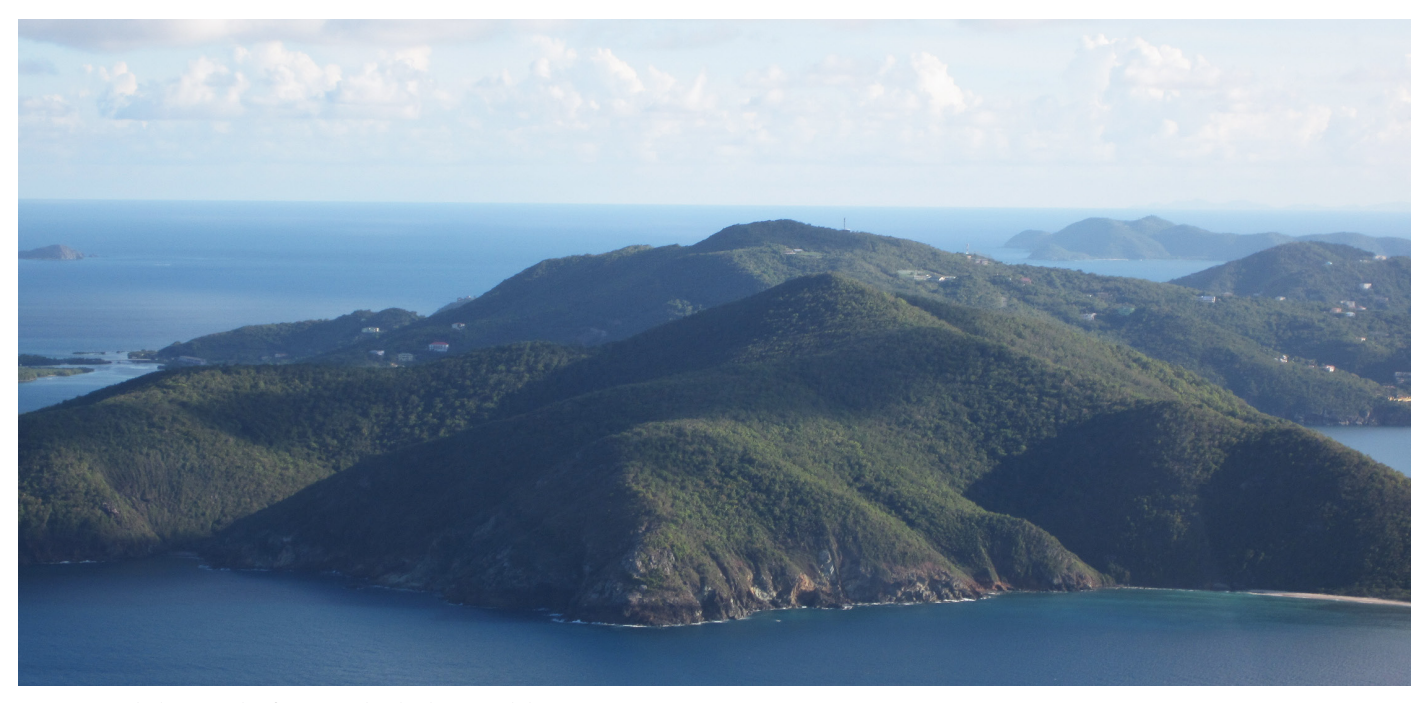
Fig. 3. Aerial photograph of Guana Island.

lation growth on Guana. We therefore focused our study on two questions: (1) What types of vertical structures do iguanas use on Guana, and (2) how do juveniles and adults use these structures differently?