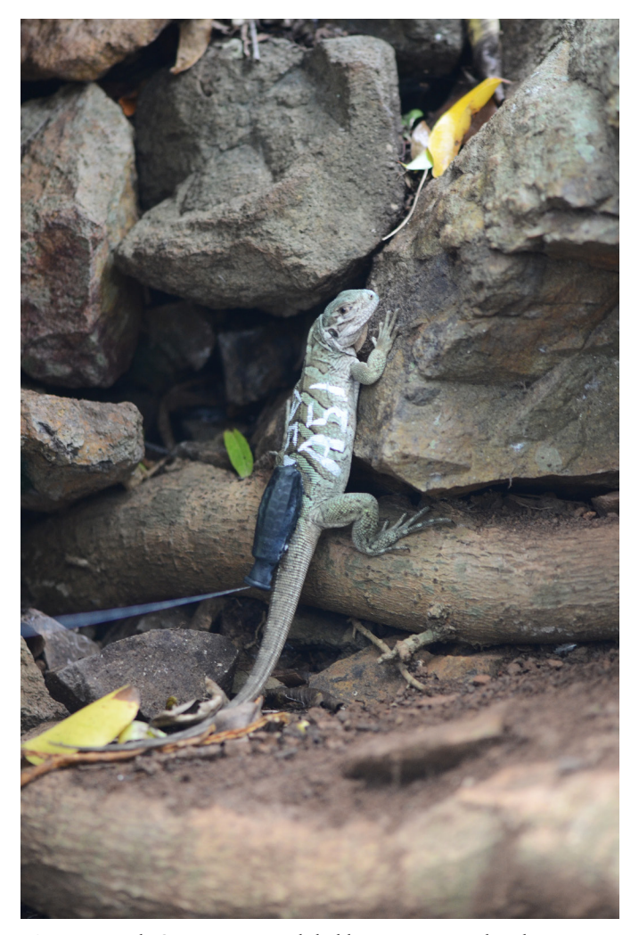
Fig. 9. Juvenile Stout Iguana with bobbin using vertical rock structure.

and Ctenosaura are found, is primarily volcanic (Malzer and Fiebig 2008). This also is the case for the Galapagos Islands, where Conolophus and Amblyrhynchus are found (White et al. 1993). In fact, although many Caribbean islands on which Cyclura are found are overlain with limestone, other Caribbean islands where other iguanas are found are of volcanic origins (Powell et al. 2005). When the ancestors of C. pinguis arrived in the Puerto Rico Bank some 33-35 million years ago (Stephen 2012), they therefore would have likely shared the ancestral state of not being limestone specialists. We consequently suggest that Stout Iguanas should perhaps be considered a refugee species (sensu Kerley et al. 2012) on Anegada, already confined to suboptimal habitats when early reports were published. This interpretation also could help explain the success of repatriated populations on Guana and Necker Islands (Perry and Gerber 2011).