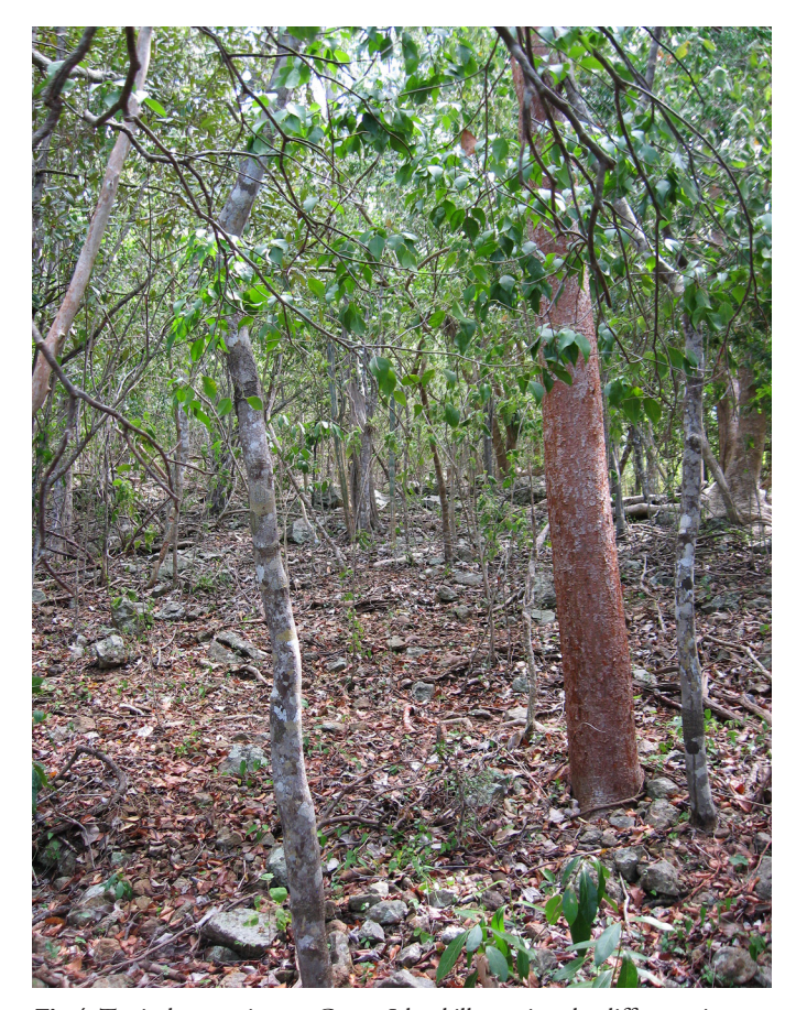
Fig 4. Typical vegetation on Guana Island illustrating the difference in vegetation when compared to Anegada (Fig. 5).

piles], rock [boulders, and rock piles], and cement structures), and the diameter at breast height (DBH) of trees used.