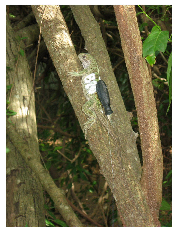
Fig. 7. Juvenile Stout Iguana with tracking bobbin utilizing a tree limb.

tions. Iguanas also may enter burrows to avoid humans traveling nearby. Additional studies of burrows would be desirable, as the substrate on Guana (volcanic rock) is substantively different from the limestone cavities available on Anegada and throughout much of the range of the genus Cyclura (Bradley and Gerber 2005).