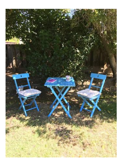
Figure 5. Anya's space in nature to "re-energize"

Participants chose to participate in occupations without gender which allowed more flexibility for self-expression. Jasper and Star engaged in a specific style of social dance that did not emphasize binary dualistic partners.