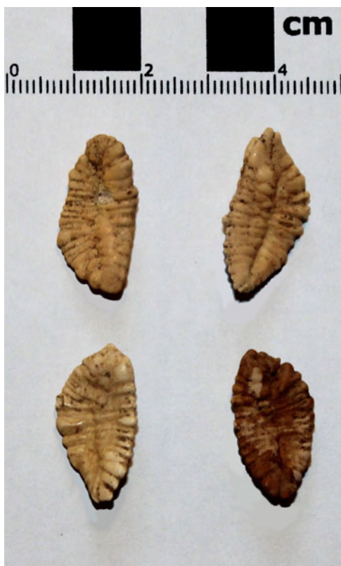
Figure 2. Examples of the Atlantic cod otoliths used in the current study. The top two otoliths represent the migratory ecotype, and the lower two otoliths the coastal ecotype.

a “Site.year [context]” refers to excavation site, year excavated, and archaeological context (e.g., BRV015[8] = Breiðavík, 2015, context 8).