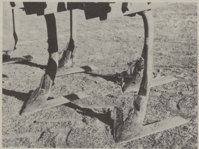
Figure 1. Here is a view of a duckfoot cultivator which is most effective in eliminating stands of field bindweed. Keep sweeps sharp and set to cut 4 inches below the soil surface with a three- to four-inch overlap between sweeps. A wider sweep or blade (30" up) is also effective in eliminating field bindweed. This implement may be more desirable on soil free from rocks where wind erosion may be a problem. It is important to leave a plentiful amount of weed and crop residue on the soil surface.

Combining intensive cultivation for part of the season with the production of a crop and chemical application is generally more practical than an entire season of cultivation. Income from the crop is obtained and erosion hazards, resulting from a full season of cultivating, are greatly reduced.