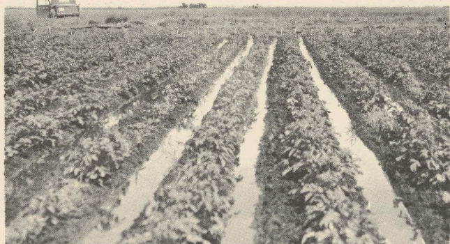
Only about 70% of this irrigation water will be effectively used. The other 30% must be removed by drainage systems.

By F. F. Kerr, Extension water resources specialist, and Raymond Lund, district specialist, Water Resources Commission