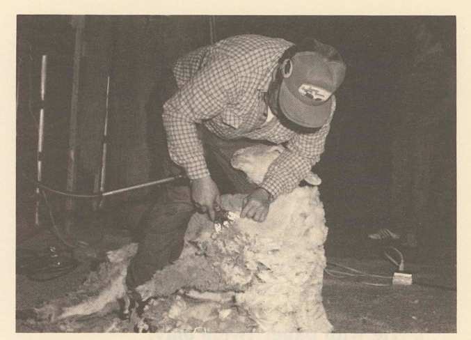
Wool is 10 to 40% of your income from sheep. It is grown throughout the year, and that means it needs attention from you throughout the year, not just at shearing time. Be clean at shearing—have the ewes dry and clean, avoid excessive bedding, use the broom regularly. Pick the best shearer you can find, one who can remove the fleece in one piece with the first cut and who is gentle with pregnant ewes.

c. Zinc sulfate, 10% solution (8 lb zinc sulphate in 10 gallons of water).