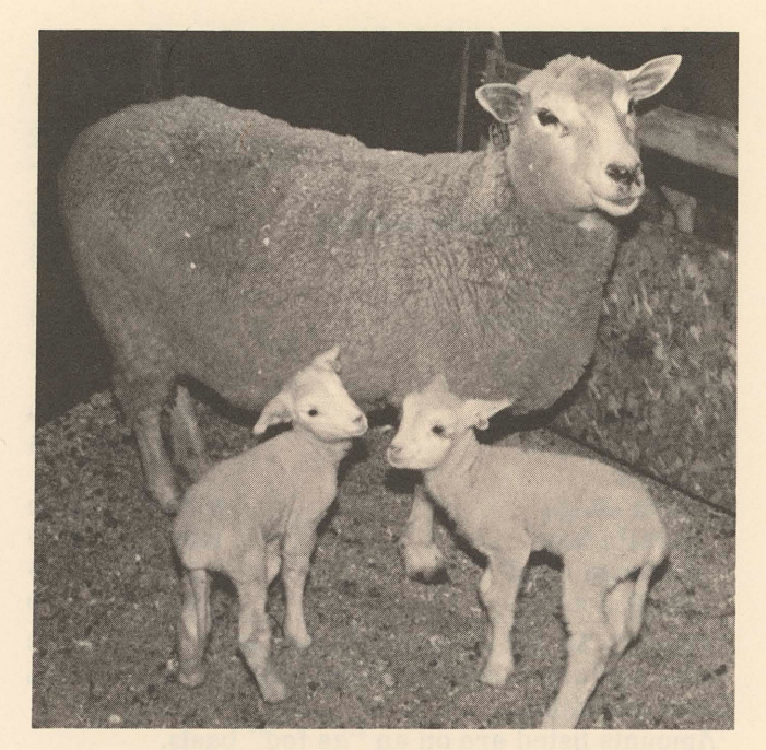
You can get twins for the same price as a single lamb; it takes no more effort, feed, or equipment on your part, but it does take closer attention to details in your flock management. A 180% lamb crop should be your goal.