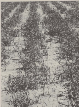
Figure 4. Carry-over effect from band application of atrazine killed bands of small grain seeded 1 year after treatment.

than pay for themselves through higher corn yields under some conditions, but not under others. Weeds reduce crop yields early in the growing season. If they can be controlled with cultivation early, the use of pre-emergence herbicides does not prevent yield reduction by weed competition. However, wet weather at the time of the first cultivation often prevents good weed control with the cultivator, and pre-emergence herbicides are very helpful.