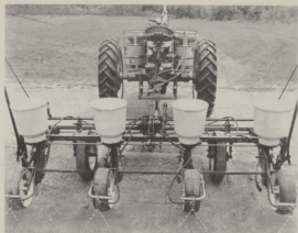
Figure 2. Corn planter equipped with sprayer attachment for band application of pre-emergence herbicides.

Therefore, it is advisable to use a harrow or rotary hoe if no rainfall occurs within 10 to 14 days after treatment. Such an operation will control weed seedlings that have started to grow during the dry spell. Atrazine will then kill later emerging weeds even though the first rainfall is delayed for as much as 3 weeks.