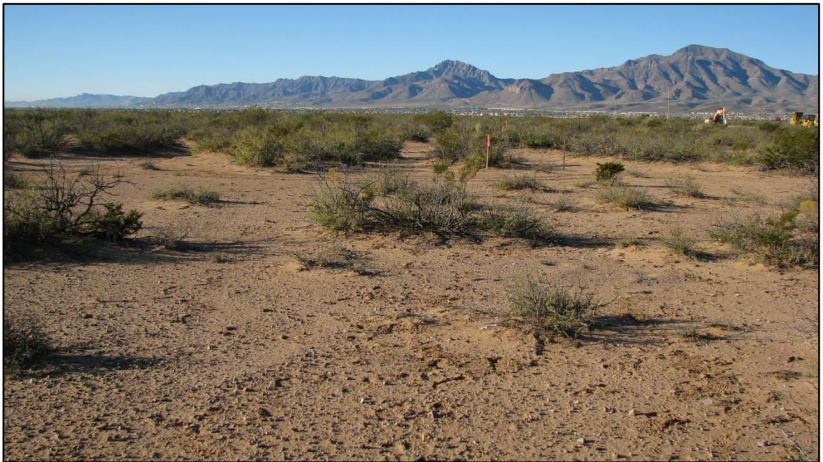
Figure 4-3. Survey parcel looking northwest, parcel boundary demarcated by wooden lathes.