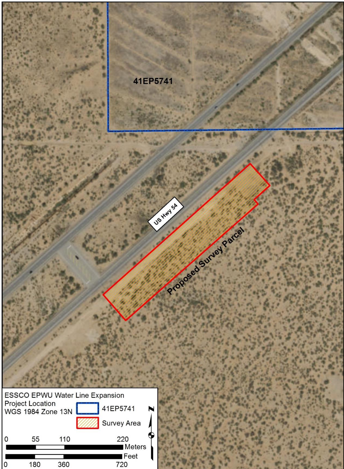
Figure 1-2. Map showing the proposed survey parcel within El Paso County, Texas.