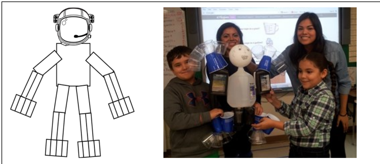
Figure 2. Two-dimensional (2D) and three-dimensional (3D) Gallon Man.

The process of collaboratively planning, teaching and evaluating led to an engaging lesson that students were able to enjoy and learn. The real world context of the lesson allowed students to make connections while learning new materials. While the responses to the evaluation survey were positive overall, the data gathered revealed consistent growth between the first and second years. When asked,