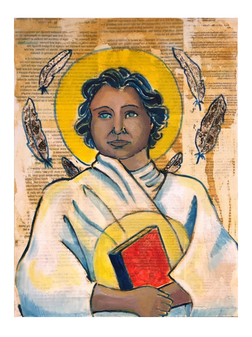
The Gift, oil and mixed media, 18in x 24in, 2019

Pundita Ramabai went against Indian customs during the 1800s and opened centers of learning for widows. During her lifetime, widows in India were expected to leave meager lives of poverty away from the eyes of the public. After losing her husband, Ramabai refused to accept this. She used her education to open centers for widows to learn life skills and discover new ways of life. She traveled to Europe and converted to Christianity. After her conversion, she opened missions in India to help widows and orphans.