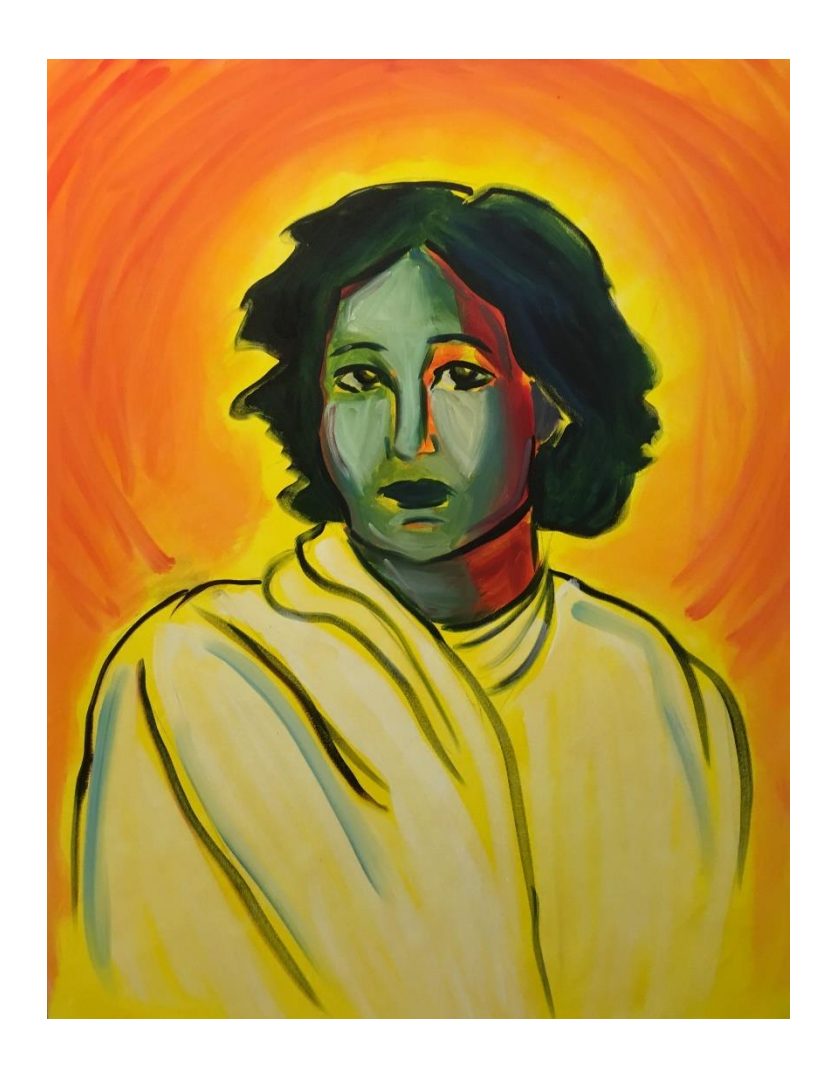
Ramabai, oil on canvas, 40in x 50in, 2018

Pundita Ramabai was an Indian social reformer and a pioneer in the education and emancipation of women in India. She was the first woman to be accorded the titles of Pandita as a Sanskrit scholar and Sarasvati after being examined by the faculty of the University of Calcutta. In the Congress session of 1889, she was one of the 10 women delegates.