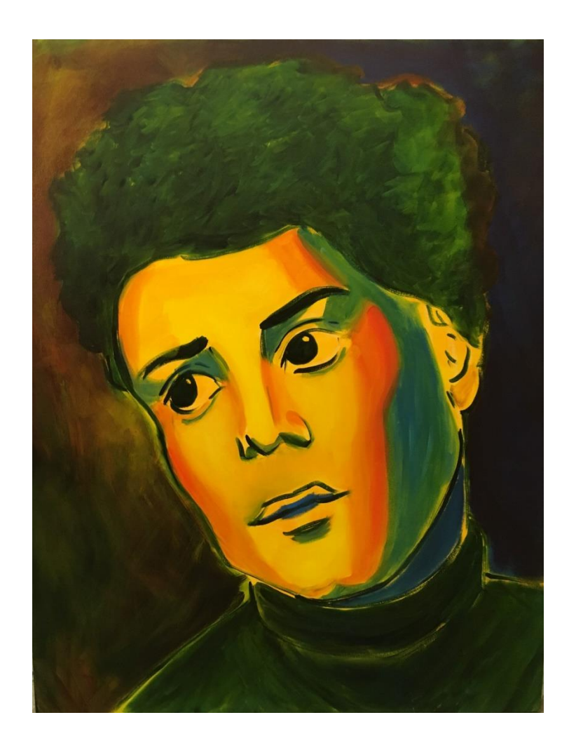
Ida, oil on canvas, 40in x 50in, 2018

Ida Bell Wells-Barnette, also known as Ida B. Wells, was an investigative journalist during the 1890s. Wells documented lynching in the United States through her indictment called "Southern Horrors: Lynch Law in all its Phases," investigating frequent claims of whites that lynchings were reserved for black criminals only. A white mob destroyed her newspaper office and presses but she continued her investigative journalism.