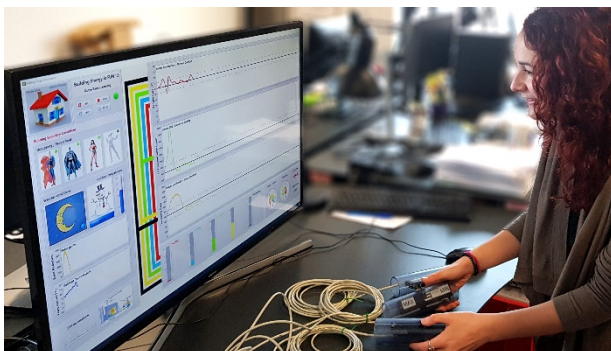
Figure 1: A player with the video game GEENIE.

GEENIE (Gaming Engine for ENergy and Indoor Environment) is an interactive video game simulating the thermodynamics of a building. The GEENIE has been developed in the LabVIEW programming environment (developed and commercialized by National Instruments ).