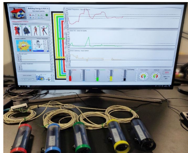
Figure 2: View of the video game GEENIE with the five controllers (sliders) for the HVAC systems.

The GEENIE consists of an arcade video game station allowing players to adjust (with hand controllers) the heating, cooling, ventilation, lighting and shading device of a simulated building (see Figure 1 and Figure 2). The players must control the power/activation level of those systems to keep the indoor operative temperature, CO 2 concentration, and illuminance as close as possible to the comfort optimum, while the dynamic boundary conditions (outdoor weather conditions, people loads) induce variations to the system.