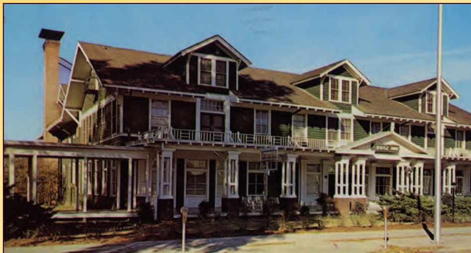
Rose Inn, ca. 1950.