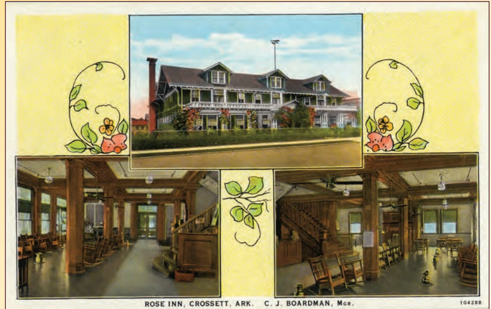
Postcard showing exterior and interior views of the Rose Inn, ca. 1930.

The Rose Inn was a stunningly beautiful building with a wide porch spanning the front. The building was "separated from the unpaved street by a wrought iron fence to keep out the cattle and hogs that wandered at will over the town until a stock law was passed in the late 1940s."