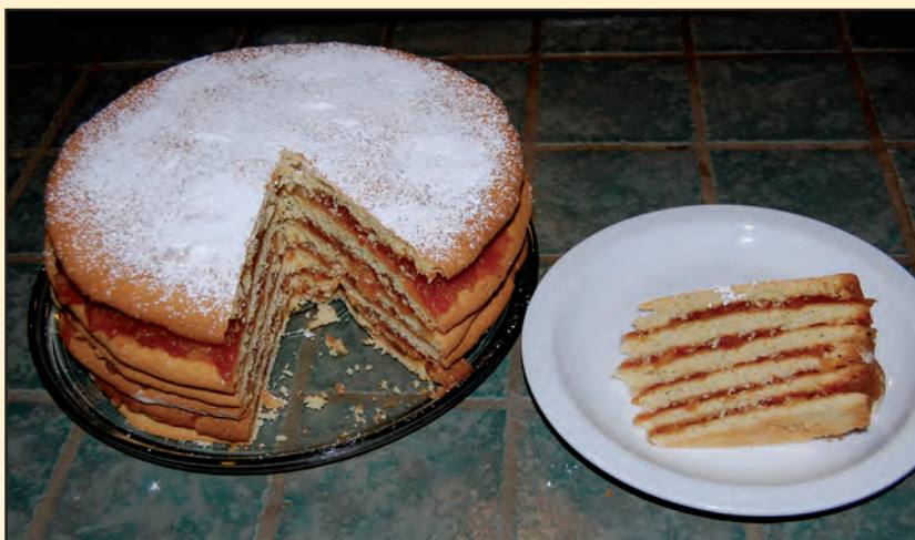
Finished apple stack cake