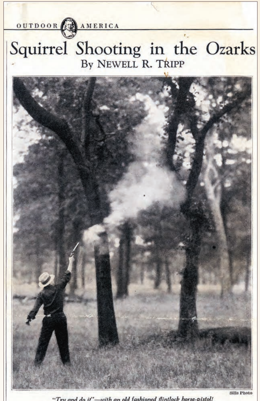
"Try and do it"—with an old fashioned flintlock horse-pistol!

"A mess of squirrel and gravy would sure be good this morning," Mom said, as she raised a finger to her lips to hush my usual chatter. "You stay here and be quiet. I'm going to try out Billy's rifle." She picked up the gun, slid a cartridge in and closed the bolt, dropping three more shells in her jeans pocket as she