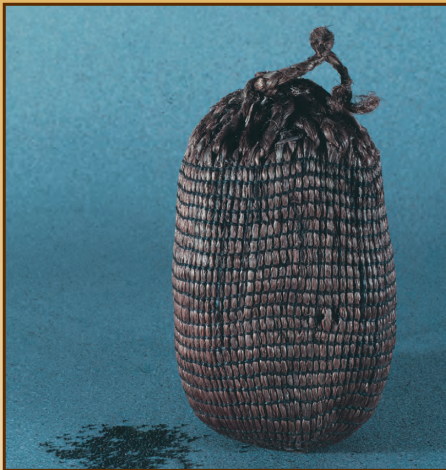
Woven bag with chenopod fruits or seeds from an Ozark rock shelter (now submerged), approximately 2,000 years old.

and shellfish were staples. Meals were roasted in fireplaces, on beds of hot rocks, or in hot ashes. Hot rock cooking in skins was likely practiced. Meat, nuts, and grains could be pounded into powder and used to thicken liquids and add flavor to the meal. Dried meat, dried grains, and fruits could be pounded into meal, and bound with grease or cooked in ashes to make cakes. Indians continued to make persimmon cakes and similar items into the historic period.