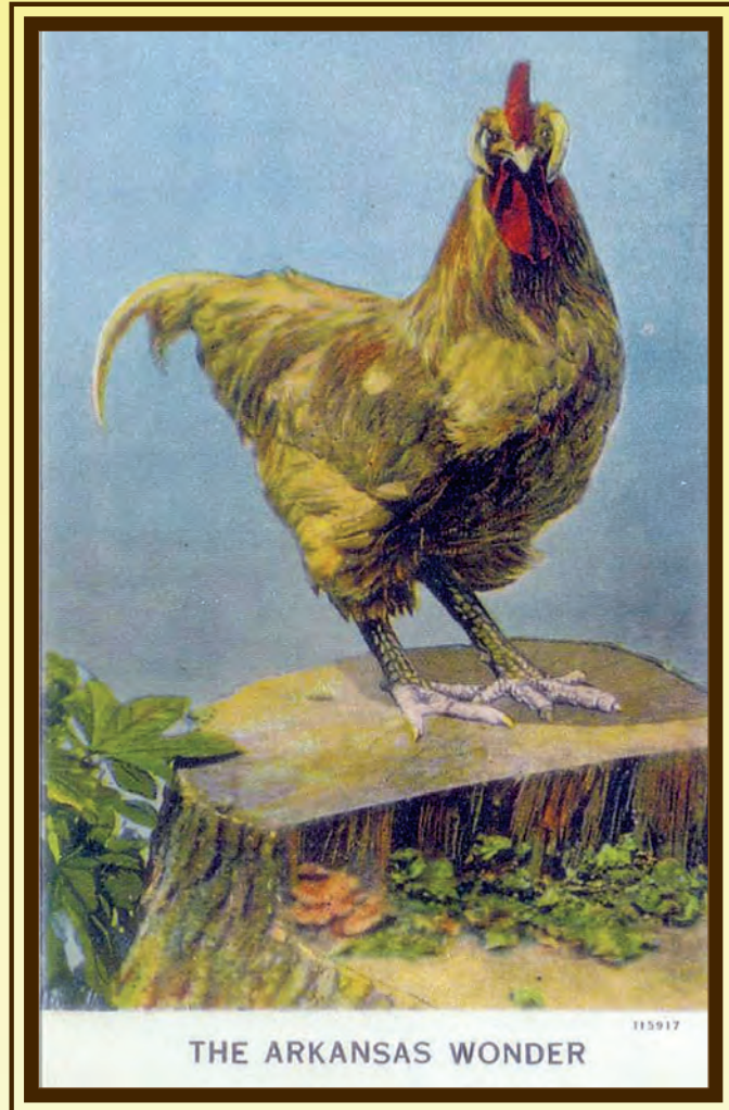
Postcard showing a breed of chicken developed in Arkansas, ca. 1900.

Church and chicken dinner were synonymous with Sunday. They were such a shared experience that our senses agreed with "the Sunday smell of someone's frying chicken" from Kris Kristofferson's "Sunday Morning Coming Down."