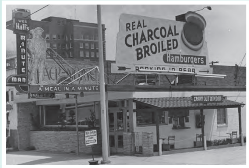
Original Minute Man restaurant at 407 Broadway in Little Rock, 1956.