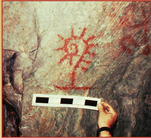
Prehistoric pictograph of a fiddlehead fern in an Ozark Mountain rock shelter.

After AD 1,000, all Arkansas Indians were dedicated to some degree to corn farming. Beans arrived from the south or west a couple of centuries later and were added to the garden, along with several varieties