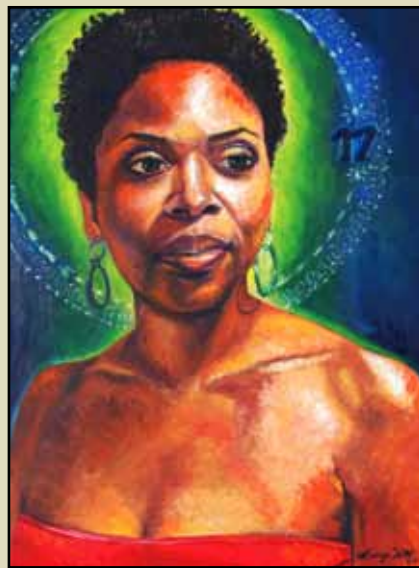
"Self-Portrait" by LaToya Hobbs.

In honor of Black History Month, the Libraries hosted an exhibit by Arkansas-native LaToya Hobbs in January and February, 2011. Hobbs's exhibit was a collection of portraits designed to promote a positive self-image for African American women by highlighting their