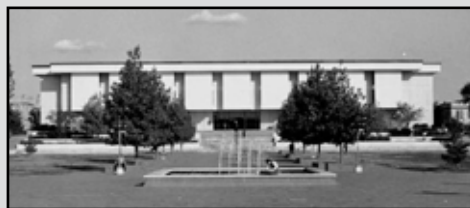
Mullins Library, circa 1982, from the Spaces and Faces digital collection.

New digital collections added during the year include Spaces and Faces: Namesakes at the University of Arkansas , which links historical photographs of the buildings on the University of Arkansas, Fayetteville campus with images of the people for whom the buildings were named. Images are accompanied by biographical information about the people and construction dates for the buildings.