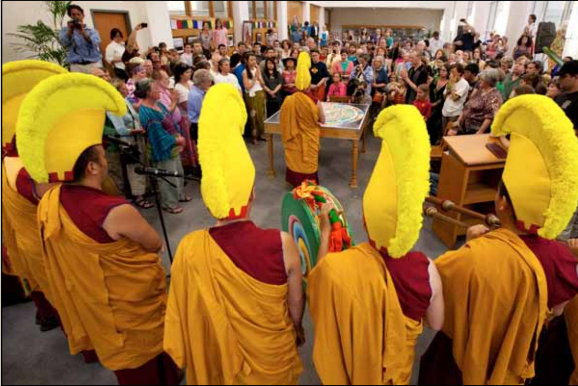
Monks from the Drepung Loseling Monastery conduct the closing ceremony for the sand mandala event.