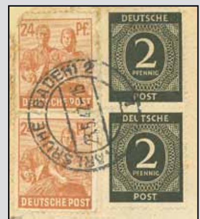
Stamps from a postwar letter to an Arkansas farmer by a former prisoner of war who worked for him.

importantly they also speak to the relationships that developed between farmers and the prisoners they hired.