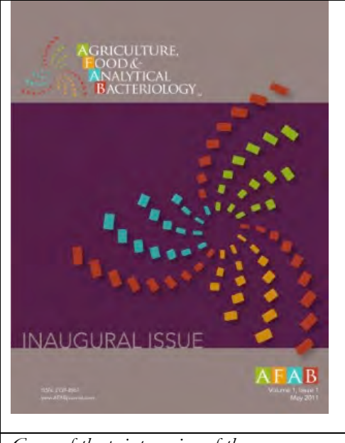
Cover of the print version of the new Agriculture, Food and Analytical Bacteriology journal .

Personnel from the UA Center for Food Safety are serving in key editorial positions for the new Agriculture, Food and Analytical Bacteriology journal. The journal, available in print and online, is a peerreviewed scientific forum for the latest advancements in bacteriology research on a wide range of topics including food safety, food microbiology, gut microbiology, biofuels, bioremediation, environmental microbiology, fermentation, probiotics, and veterinary microbiology.