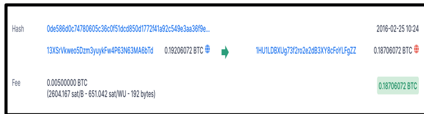
Figure 1: An Example of a Transaction Stored on Bitcoin's Public Ledger

This transaction, which occurred on February 25, 2016, shows a transfer of value from the sender's address on the right to the receiver's address on the left. The sender also provided a small transaction fee for the miner of .005 bitcoins. The "hash" is a unique transaction identifier calculated from the inputs.