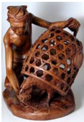
POULTRY COLLECTION — A wood carving from Bali of a farmer hand-feeding a rooster is one of the more than 500 pieces in the Melvin and Lorraine Fields Collection, dedicated June 6 in the Department of Poultry Science.

The Fields Collection was dedicated June 6. The pieces — in crystal, enamel, bronze, teak, gold, silver, porcelain, rose quartz, terra cotta, jade, serpentine, steatite, wood and other materials — represent many different art forms and are on exhibit on the first and second floors of the Poultry Science Building.