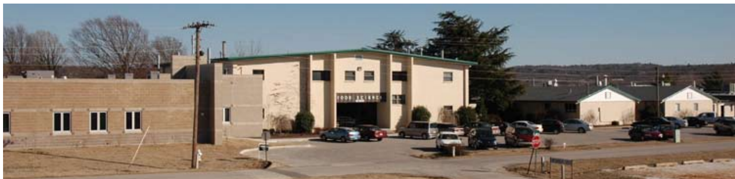
The Food Science Department is housed in a 52,000 sq. ft. complex of laboratories, classrooms, a pilot processing plant and offices built in stages from 1958 to 2006 at the Arkansas Agricultural Research and Extension Center 1.5 miles north of campus.

Each program area includes a staff of supporting scientists and graduate students who contribute to the nationally ranked scholarly productivity of the faculty, Buescher said. ■