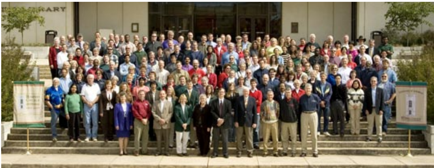
FAMILY PHOTO – The centennial time capsule includes this photo with the names of Bumpers College faculty and staff members and a few students. The 165 persons represent each of the College departments. They gathered on the Mullins Library steps following the annual Dogs with the Dean lunch Oct. 7.