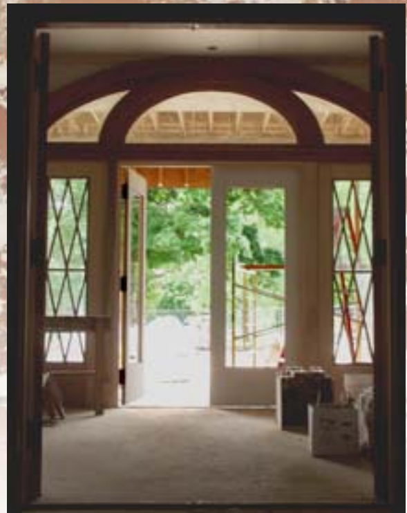
Interior renovations are restoring Carnall Hall's architectural finery. The overhaul will give the former women's dormitory new life as a hotel and restaurant.

T he Inn at Carnall Hall will open this summer, and hospitality and restaurant management students in the School of Human Environmental Sciences and Bumpers College will attend classes there this fall.