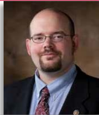
STAR Christian Goering secondary education