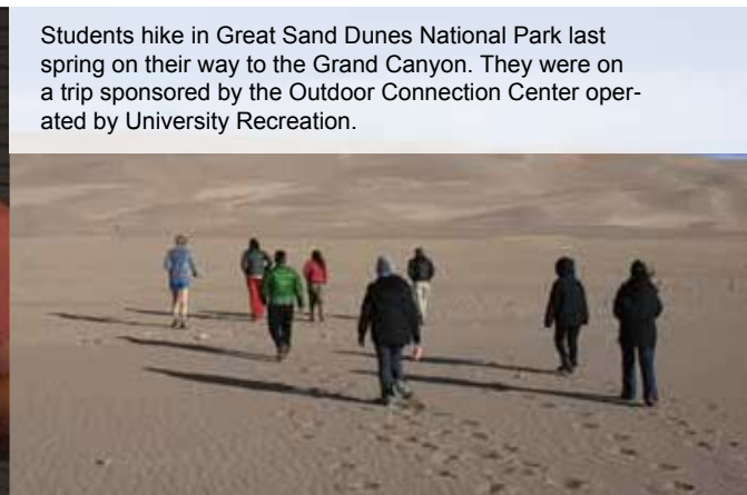
Students hike in Great Sand Dunes National Park last spring on their way to the Grand Canyon. They were on a trip sponsored by the Outdoor Connection Center operated by University Recreation.