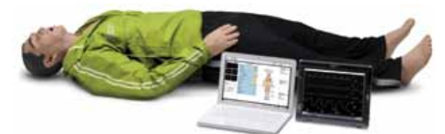
The iStan is a lifelike human patient simulator that can present a new medical history and clinical scenario for each training session. The simulator’s cardiovascular, respiratory and neurological features operate in concert to produce realistic responses to clinical treatments.

“We invite anyone else who may want to be a part of this exciting new facility to contact our development staff,” he continued. “We’re very proud of our programs that will benefit from the facility, and we’re proud of this addition to the college’s facilities.” ■