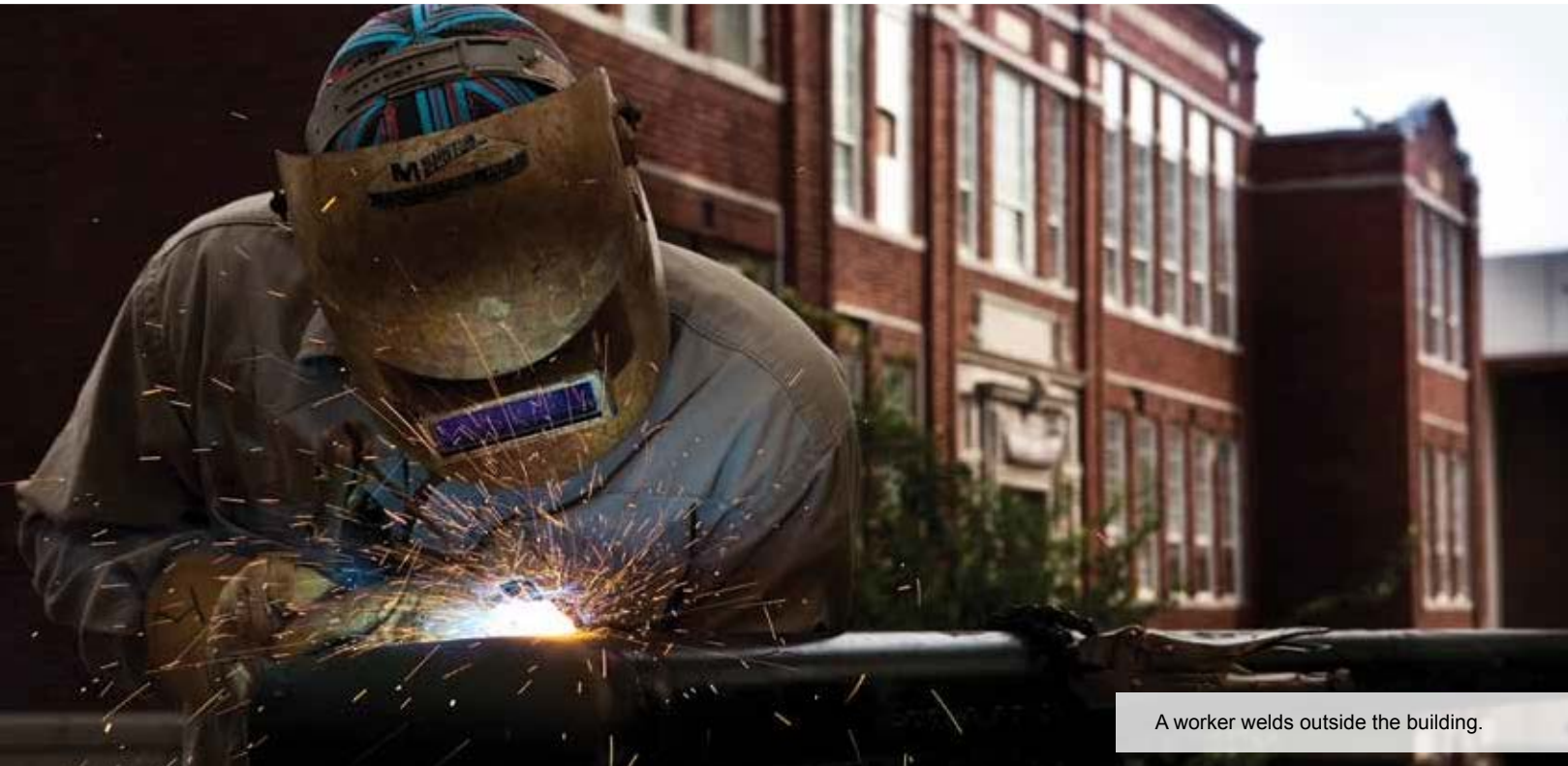
A worker welds outside the building.