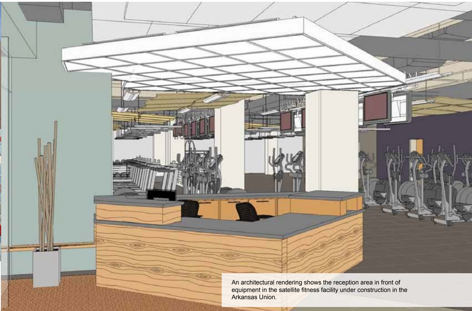
An architectural rendering shows the reception area in front of equipment in the satellite fitness facility under construction in the Arkansas Union.