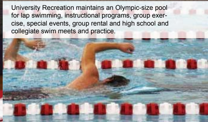
University Recreation maintains an Olympic-size pool for lap swimming, instructional programs, group exercise, special events, group rental and high school and collegiate swim meets and practice.