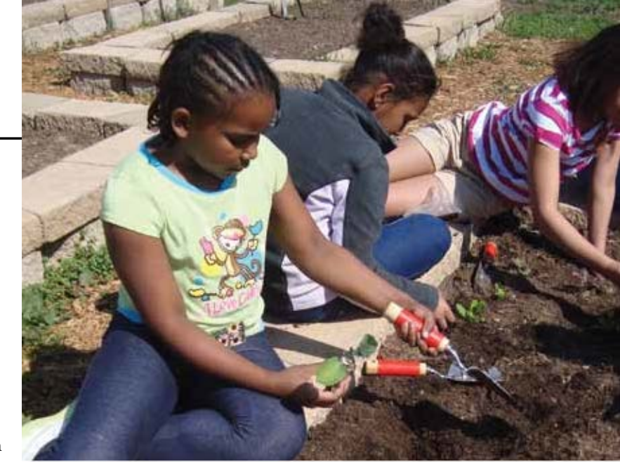
Students at Owl Creek School in Fayetteville plant seedlings as part of an after-school gardening club sponsored by Apple Seeds Inc., a Fayetteville-based organization that is working with its first intern from the community health promotion program this semester.

Apple Seeds Inc. welcomed its first intern from the program