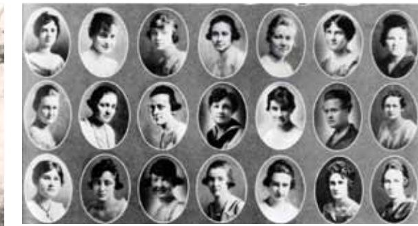
Members of the Normal Club are pictured in the 1918 Razorback yearbook. A normal school was a school created to train high school graduates to be teachers. The name came from the school's purpose of establishing teaching standards, or norms.