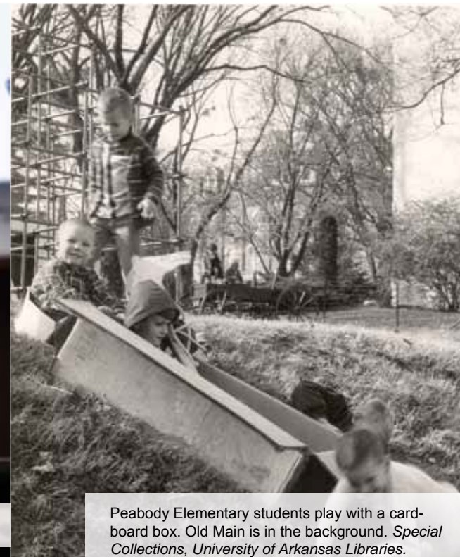
Peabody Elementary students play with a cardboard box. Old Main is in the background.