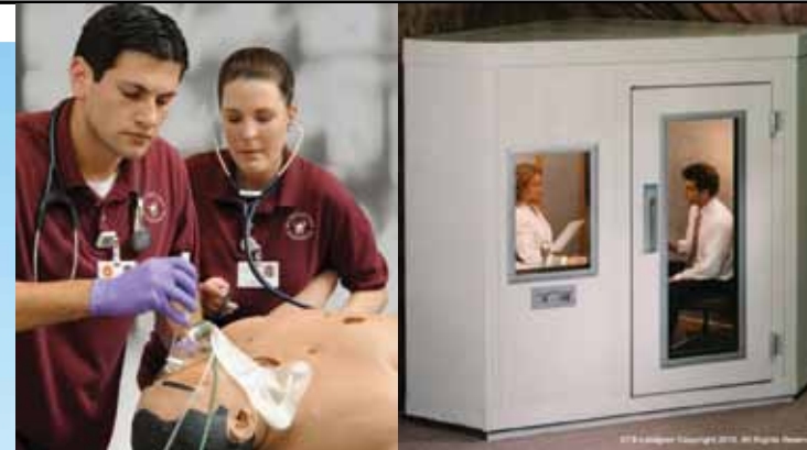
Far Left: Students at a nursing school in California work with a human patient simulator like the ones that will be used in the laboratories of the new Lewis and Donna Epley Center at the University of Arkansas.