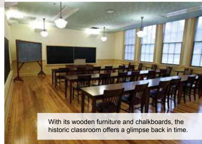
With its wooden furniture and chalkboards, the historic classroom offers a glimpse back in time.

Calvin Bain of Bella Vista received the opportunity to