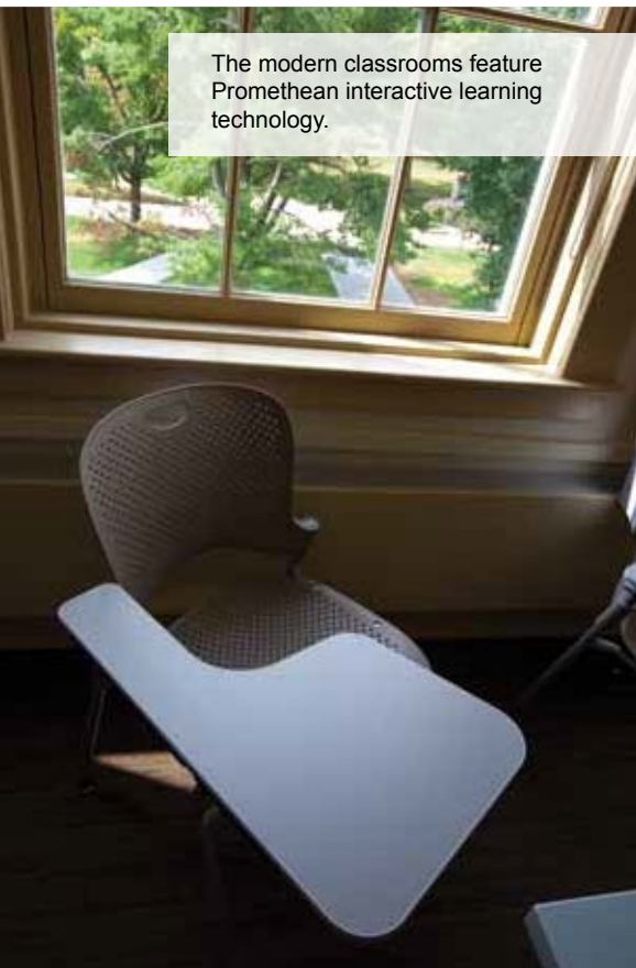
The modern classrooms feature Promethean interactive learning technology.