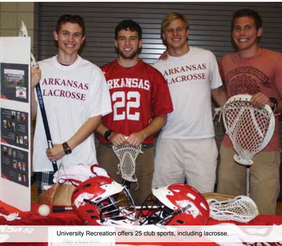
University Recreation offers 25 club sports, including lacrosse.