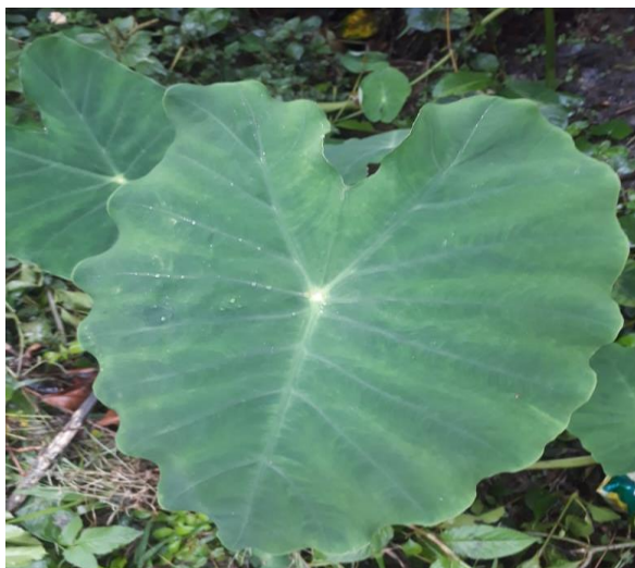
Fig.1: Colocasia esculenta sample from Western Ghats

phenol are present. The results also revealed the absence of tannins, quinines and steroid in both the extracts. (Krishnapriya et al. , 2017). The present study was focused on evaluating the antioxidant and phytoactives in the aqueous and ethanolic extracts of leaves extracts of Colocasia esculenta .