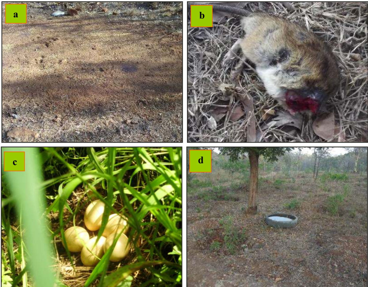
Fig. 2: Habitat association of Pavo cristatus in Bangalore University Campus, India.

a - Artificial feeding of grains; b - Food (rat carcass) remains after consumption by Indian Peafowl; c - Eggs laid in simple ground nest surrounded by grasses; d - Artificial water source