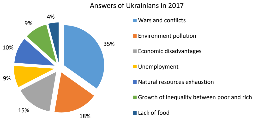
Figure 2. Detection of global threats for future generations: answers of Ukrainians in 2017