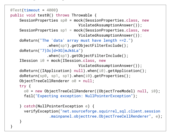
Fig. 9: Example of a test case with failed setup.

just a constructor invocation but does nothing with it at all. Such invocations will show up as providing code coverage for the methods being inspected; however, with no assertions taking place, it tests nearly nothing of semantic importance<sup>4</sup>. This reflects a disconnect between the optimization metric of "coverage" and real-world validity of test cases; addressing this could lead to more useful support for developers.