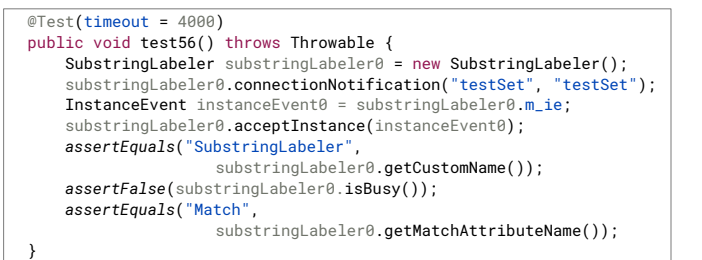
Fig. 4: Example of eager test.