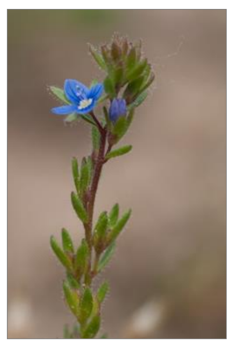
Veronica dillenii.