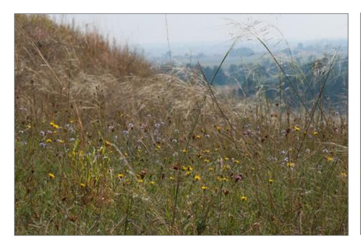
Potentillo arenariae-Stipetum capillatae with Stipa capillata, Scabiosa canescens and Hieracium umbellatum.

Among all the studied grassland sites, the "Gabower Hänge" was one of the most fascinating ones for me. In the following years, I regularly organized vegetation ecology field courses in the Biosphere Reserve, and always this site was one of the highlights. During one of the classes conducted in 2015 we resampled some of my more than 20 year old plots. Interestingly, we found hardly any vegetation change; if at all to the better.