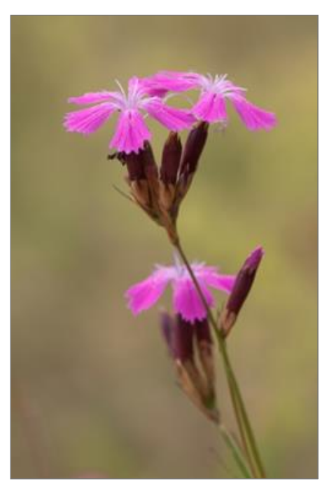
Dianthus carthusianorum.