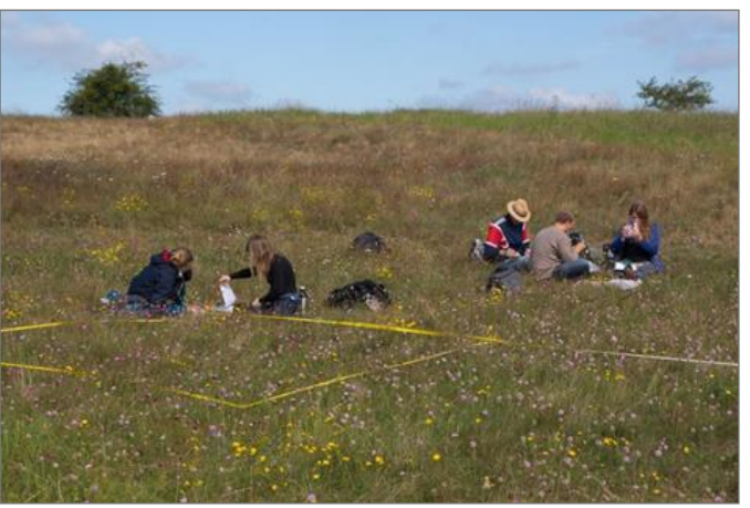
Students of the University of Bayreuth sampling EDGG Biodiversity Plots in an extensive stand of the Armerion elongatae.