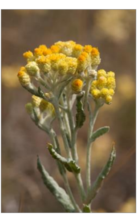
Helichrysum arenarium.