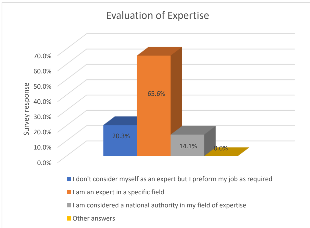
Figure 1: Responses to level of expertise

On another front, all of the interviewed women are authorities in their respective fields. In the larger sample of surveyed women leaders, results indicated that 14% of the respondents claimed that they are in fact among the foremost specialised authorities in their respective field in the Arab region. A majority of 65% of the respondents considered themselves an expert in their field, while around 21% admitted that although they may not be experts, they are good at their jobs.