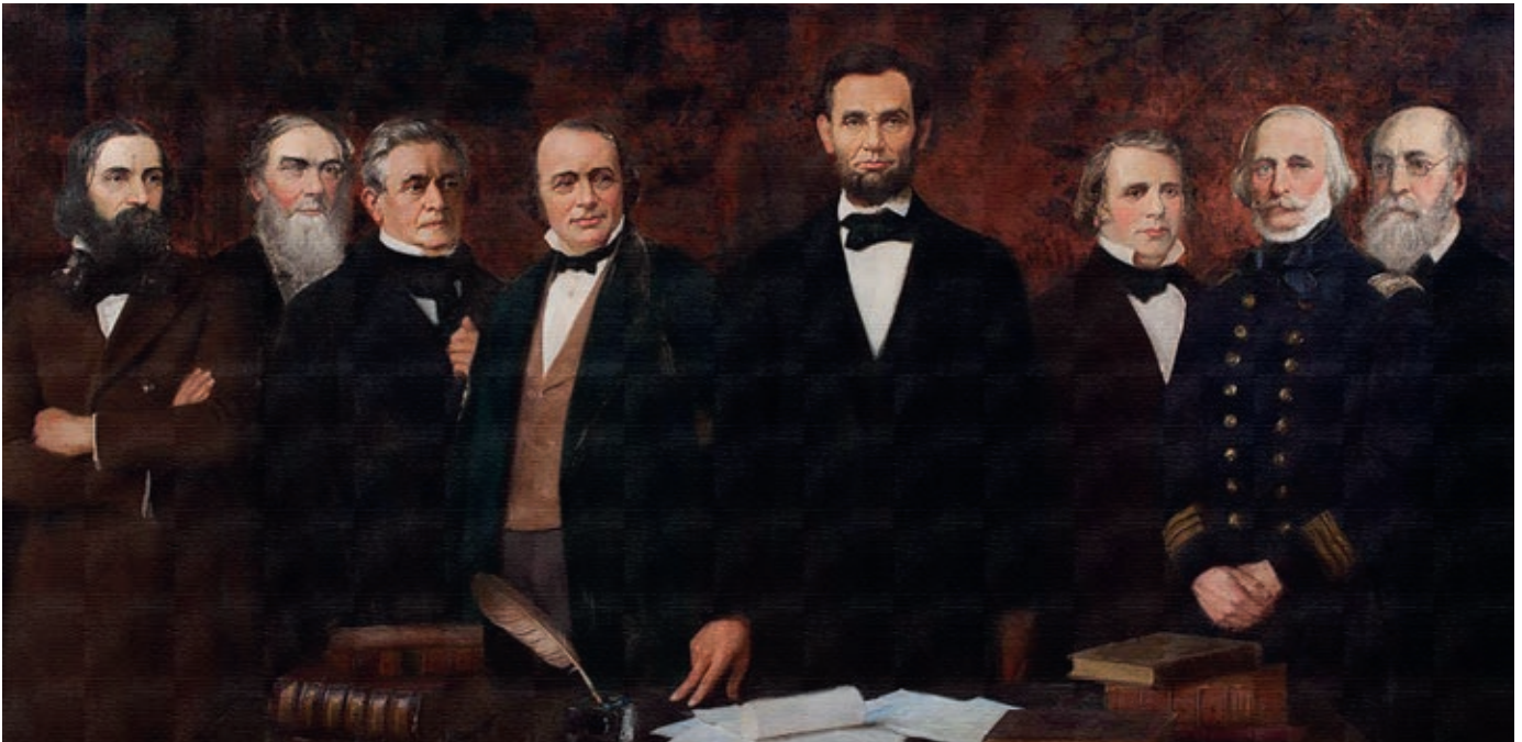
President Abraham Lincoln signing the Charter of the National Academy of Sciences (NAS). Apocryphal rendition shows Lincoln with several founding members of the NAS. Left to right: Benjamin Peirce, Alexander Dallas Bache, Joseph Henry, Louis Agassiz, President Lincoln, Senator Henry Wilson, Admiral Charles Henry Davis, Benjamin Apthorp Gould.

War Department's bureaucracy after fire ravaged the Smithsonian Castle in January 1865. Upon an urgent request from Henry, Lincoln saw to it that the building's roof received critically important emergency repairs.