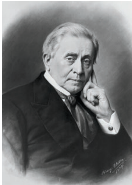
Dr. Joseph Henry, first Secretary of the Smithsonian Institution.

In March 1863, eight months after the passage of the Morrill Act, Lincoln signed an Act of Incorporation creating