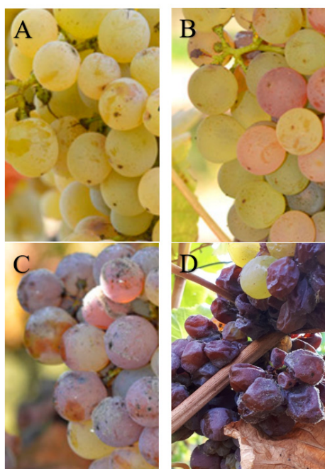
Figure 1. Stages of botrytization in the ‘Semillon’ variety. Healthy stage (A), mild infection (B), pourri plein (C), and pourri rôti (D) (Blanco-Ulate et al. , 2015) (Photo courtesy of Château la Varière, Brissac-Quincé, France).

Many are the theories for the region where accidental production of this type of sweet wine took place for the first time. One possibility is that it happened in Tokaj of Hungary, where the first reports dated back to 1560 (Thakur, 2018). Another possible region, is Schloss Johannisberg of Germany in 1775, in which the winemakers were allowed to harvest only after the permission of the owner who forgot it. As a result, the harvest was very late leading to development of B. cinerea on grapes (Thakur, 2018). Finally, in 1815 when the two Coalition armies invaded in Paris, late harvest and botrytization occurred (Keller, 2015).