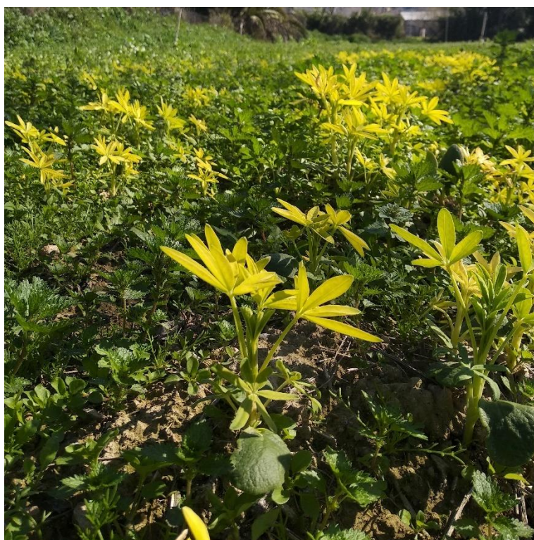
Figure 1. Chlorosis symptoms in L. mutabilis grown on soil with high calcium carbonate content ( \text{CaCO}_3 —37.3%).

Lupins are calcifuge species [75]. A significant variation in tolerance to the lime content of soil among Lupinus species has been observed [29,76,77]. Calcium carbonate ( \text{CaCO}_3 ) in combination with alkaline soils can be catastrophic for the cultivation of Andean lupin. Andean lupin plants grown on soils with a high calcium carbonate content usually exhibit chlorosis symptoms (Figure 1), although different levels of susceptibility have been observed among different genotypes [78]. In alkaline soils, calcium carbonate inhibits iron uptake [79] and has a negative effect on plant photosynthesis, inhibiting the shoot growth rate and seed yield [80]. Although, L. mutabilis is more tolerant than L. luteus and L. angustifolius , it presents similar sensitivity to calcium carbonate in the soil as L. albus [61].