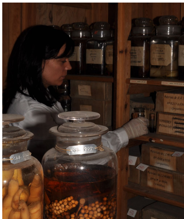
Figure 2. Botanical collections survey (IICT, 2013).

As far as collections' care is concerned, initial priority was given to locate and identify IICT's diverse and dispersed heritage. The task was challenging due to the sequence of institutional reforms and IICT's geographic dispersion. In 2003, the Institute had 24 different addresses in the city of Lisbon, Oeiras and Coimbra. A significantly heterogeneous situation was found, from considerably accessible and curated collections such as the LISC Herbarium and the AHU, to the lack of curatorial staff in other research centres for collections care, which became increasingly acute, mostly due to staff ageing. This situation inevitably led to risk of damage and loss due to inappropriate storage or lack of preservation facilities. Given this scenario, the principal task was to set up a systematic survey to identify and characterise the different collections (Figure 2). An inquiry was sent to researchers in charge, followed by regular visits by small teams, which always included a conservator-restorer, a specialist/curator and a collections manager. Characterisation included the collection's dimension/volume, their storage and conservation condition, their use (e.g., research, exhibition, others), regular care procedures and the level of treatment required. The existence of associated documentation was considered critical as it enables proper inventory and heritage significance recognition, thus was also registered in the survey.