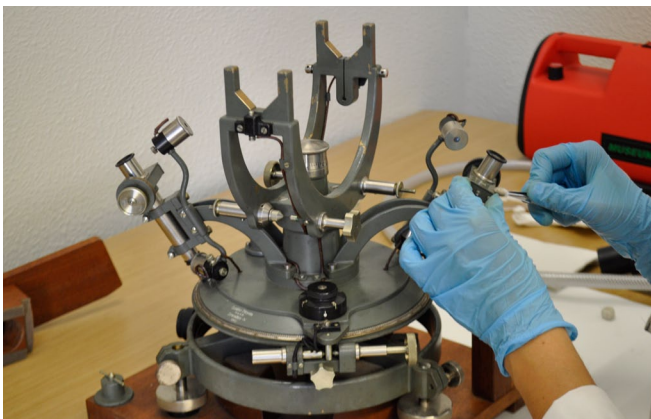
Figure 3. Cleaning operation of scientific equipment (IICT, AHU, 2010).

In 2006, the importance of the Portuguese Initiative was emphasised and supported by UNESCO. Joie Springer, a member of the information society division and the universal section Access and Preservation of UNESCO, visited the IICT. Springer considered that IICT should increase access and dissemination of heritage, which she considered of the highest relevance for humanity. Apart from the study, treatment and digitization, Springer suggested an application to the UNESCO program Memory of the World Register in order to seek recognition of the outstanding universal value of some of the IICT documental collections. Increasing access to IICT heritage included collections study, identification and classification, as well as their online accessibility. Individual databases with digital inventories did exist, but they brought little added value to the heritage as a whole, representing, as mentioned early, only 17 % of the total collections. Thus, expansion of the digital inventory scope was an early objective. For the Herbarium, the BRAHMS database, a natural history database developed by the University of Oxford to manage the collection, already adopted by IICT researchers, was kept in use. In parallel, SPECIFY, an open access software common with biological collections, was adopted for the zoology collections; and the software MATRIZ – Museum Collections Inventory and Management, used by national museums in Portugal, was adopted for the ethnographic and archaeological collections.