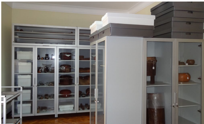
Figure 6. Open Storage Room (IICT, Calheta Palace, 2012).

The last two decades have been shaped by the effort to make IICT scientific data available to global networks and the need to create worldwide information platforms accessible to all researchers (e.g., GBIF; EUROPEANA Collections). A significant corpus of scientific research has resulted from these efforts, as detailed in the next section.