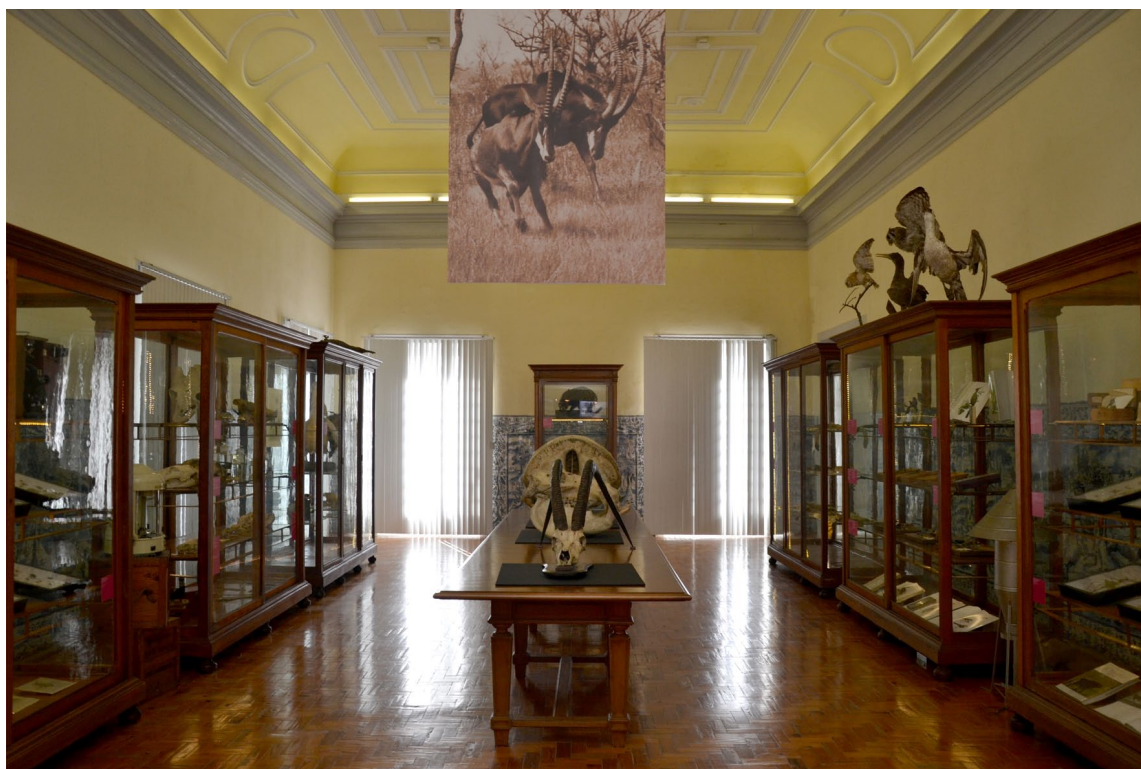
Figure 5. Exhibition “Viagens e Missões Científicas nos Trópicos 1883-2010” (IICT, Calheta Palace, 2010).

In 2007-2008, a second main step was to provide access to IICT collections and archives through a single online platform. ACTD, an institutional repository based on open source software, was created, bringing together primary information from several databases and enabling users from all over the world to conduct autonomous searches based on the item type, scientific domain/topic and geography. This online platform aimed to collect, preserve, manage and disseminate both IICT's collections and research outreach, thus encouraging innovation in tropical scientific research.