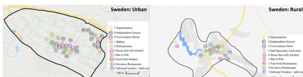
Figure 3. Distribution of food retail outlets in Sweden (not to scale).