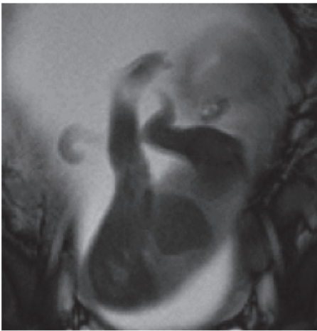
FIGURE 2: Fetal MRI at 26 weeks of gestation showing short forearms and hypoplasia of hand fingers.