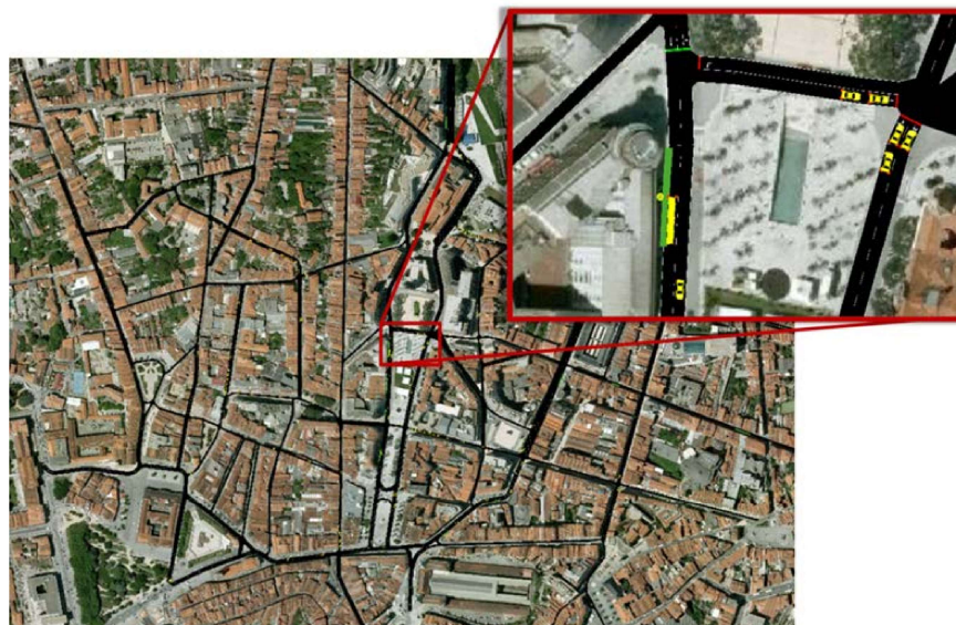
Figure 11-1: Aliados region and detailed representation of traffic on SUMO simulator.

The simulation was then performed twice for exactly same route: one using regular acceleration rates, based on the normal operation of the bus, and another for the "aggressive" behavior, which for this paper is characterized by higher values of acceleration rates and faster braking.