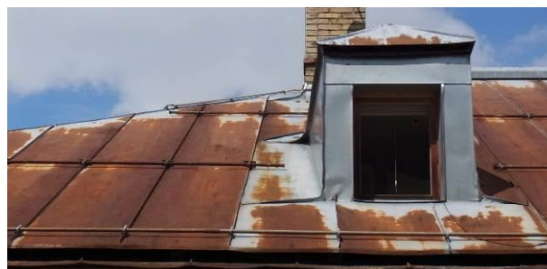
Figure 1. Roof made from galvanized steel, after years of service in rural, alpine climate.

Figure 1 presents the view of a roof made from galvanized steel, observed in rural, alpine area. Although its visual appearance looks catastrophic, it is still free of leaks. A case of corrosion failure?