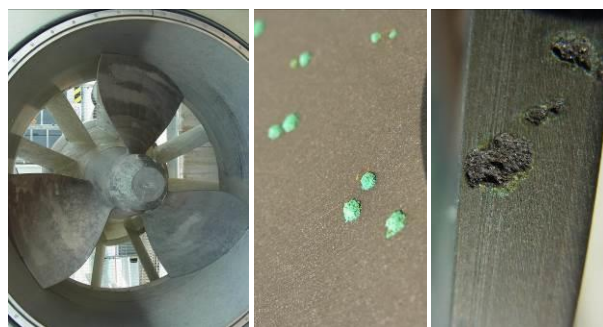
Figure 4. Kaplan runner enclosed by the runner ring (left), with numerous green tubercles (middle) covering pit-like metal loss of several mm diameter (right).

Few months after taking in service, turbine runners made from nickel-aluminium bronze (NAB) developed green spots - obviously accumulations of corrosion products covering localized loss of material, see Figure 4. The fresh water of very low salinity indicates evanescent corrosiveness for NAB, not explaining this phenomenon. In addition, the galvanic coupling to the runner ring made of stainless steel (SS) is generally known to be a feasible technical solution in fresh water. A case of poorly produced cast material?