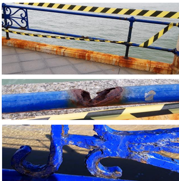
Figure 2. Second Sardinero beach corroded handrail. From top: General view, broken pipe detail, corrosion products underneath the coating. (View after maintenance work).

un-esthetic and safety critical situation re-appeared (Figure 2). How can this happen?