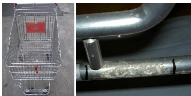
Figure 3. Supermarket trolley with severe indications of corrosion (e.g. detail right), giving an untidy impression.

Trolleys such as the one in Figure 3, from a particular producer, developed unsightly appearance after (compared to other products) relatively short time in service, in supermarkets at various locations. A case of poor material selection?