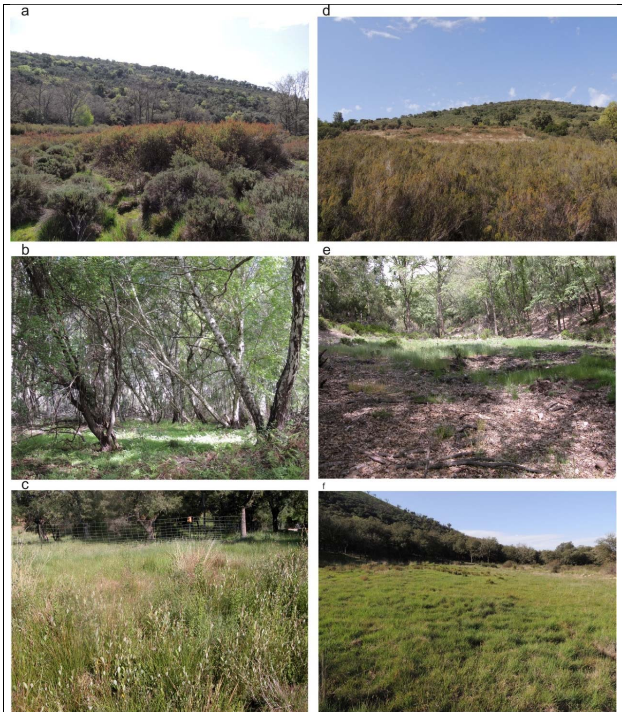
Figure 2. Peatlands in the Toledo Mountains: (a) the ombrogenous site of Brezoso; (b) birch forest on La Ventilla peatland; (c) perimeter fence of the Bermú site; (d) Canalejas peatland; (e) Valdeyernos peatland; (f) open habitat on Fuente de la China peatland, which is influenced by periodic disturbance and hosts a large population of Rhynchospora alba .