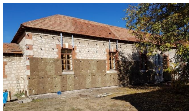
Fig. 1. Insulation layer over the existing masonry façade during the retrofit phase.

ceramic tiles. A suspended ceiling system incorporates a thermal insulation layer composed of 8 cm thick mineral wool panels. This insulation was placed in one of the renovations that the building has seen throughout its years of use.