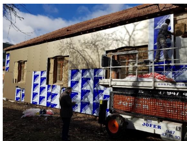
Fig. 2. Installation of the ventilated cladding system on top of the insulation layer.

The building envelope insulation was performed in December 2017.