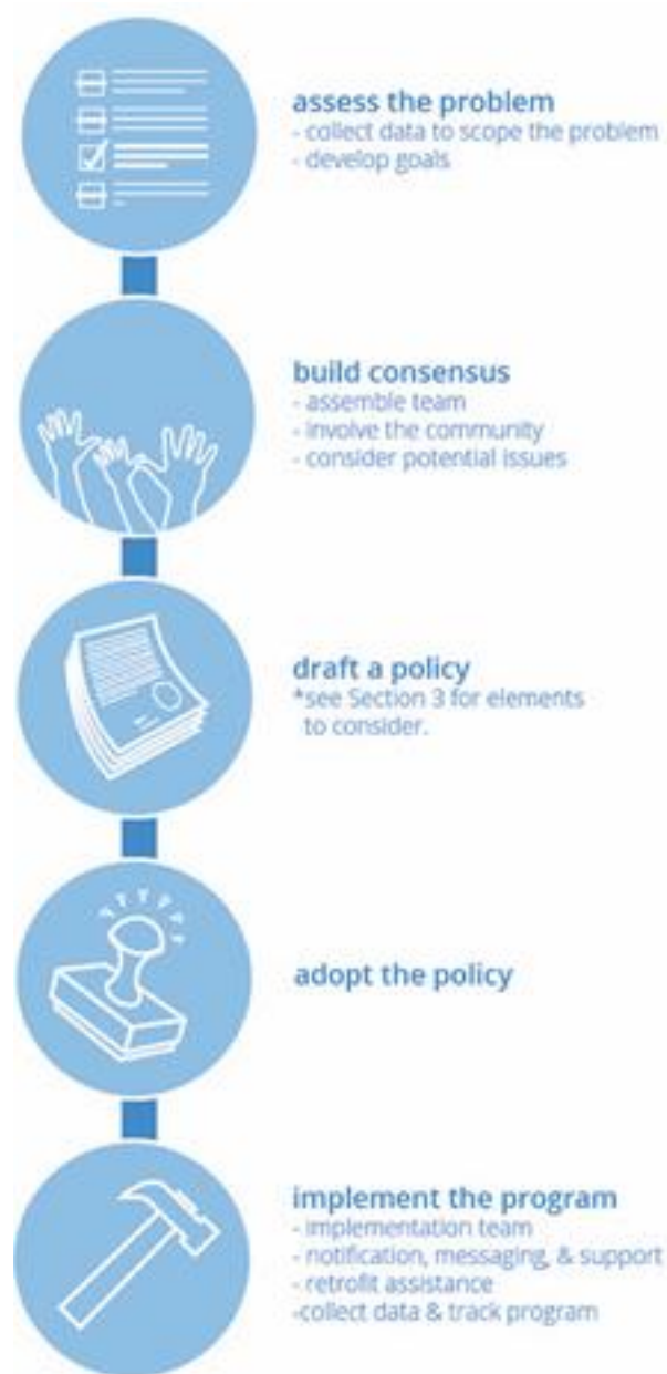
Figure 1: Five Steps to Plan for a Soft-Story Retrofit Program