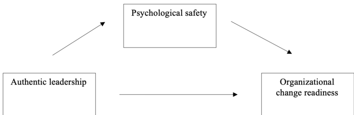
Figure 1. Psychological safety as a mediator of the relationship between authentic leadership and organizational change readiness.

Hypothesis: Psychological safety will mediate the relationship between authentic leadership and organizational change readiness, such that authentic leadership will lead to higher perceptions of psychological safety, which in turn will be associated with higher organizational change readiness.