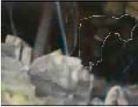
Figure 6 Faint image of a casualty recorded by CAT