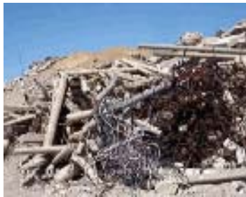
Figure 2 Example of rubble pile

However, they are not versatile enough for all types of terrain that may be encountered in real disaster situations which commonly include similar to that shown in Figure 2.