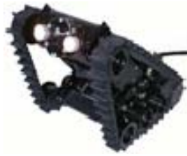
Figure 1 Variable geometry tracked response robot