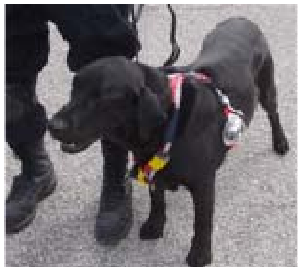
Figure 3 CAT II on a disaster dog

CAT consists of an architecture of related hardware and software modules. Figure 4 displays a block diagram of the CAT system. Figure 3 is a photograph of one such operational implementation.