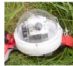
Figure 5 Pan/Tilt IR camera with protected dome

The current implementation of CAT consists of a pair of pan/tilt shoulder mounted and armored infrared video cameras. One of these is depicted in Figure 5.