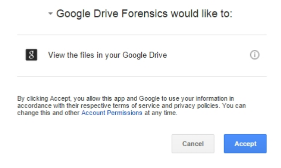
Figure 3-2 Authorization page

In the process above, the user of the application must enter email and password in order to gain access to the target Google Drive account. However, this step is possible to bypass. Once the OAuth 2.0 process begins and opens the page, if the user has already signed in with a Google account with the same browser, or cookies are used to keep the user stay signed in, then the page in Figure 3-1 will not appear. Instead, the user will see Figure 3-2 directly, skipping the stage where username and password are needed. This feature can be extremely helpful to digital forensic examiners when username or password of the target Google account is unknown.