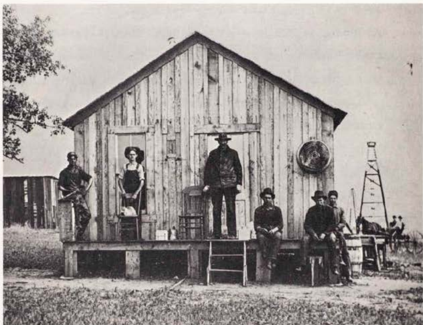
Fig. 2.--"Boom town hotels were hastily constructed and provided few comforts and conveniences."