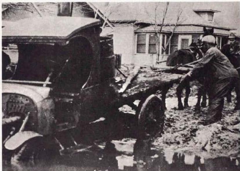
Fig. 4.--"When cars became stuck it frequently took horses to pull them out of the mud." Seminole, 1920's.