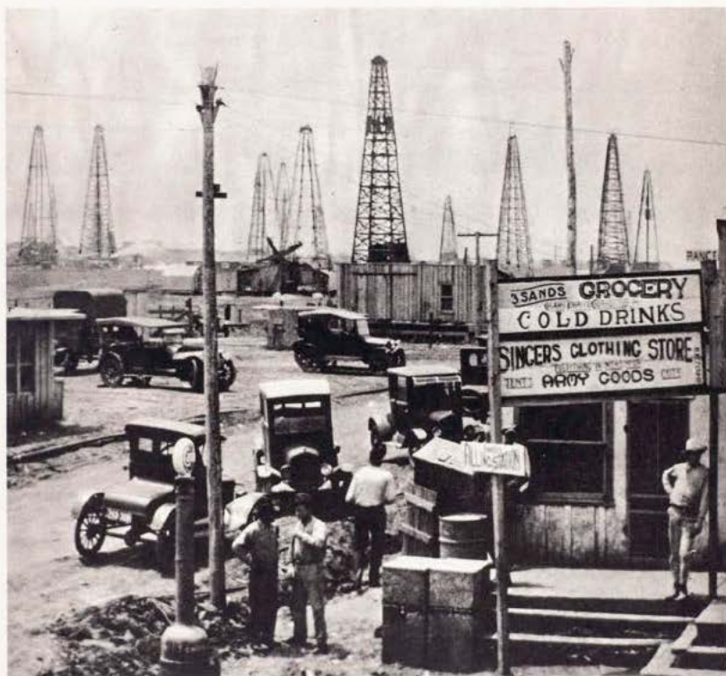
Fig. 5.--"The growth of many small businesses in the boom towns represented another type of speculation." Three Sands in the 1920's.