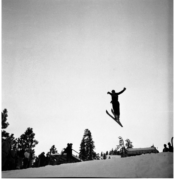
Courtesy of Central Washington University, Brooks Library, Hogue collection. Note the two jumps.