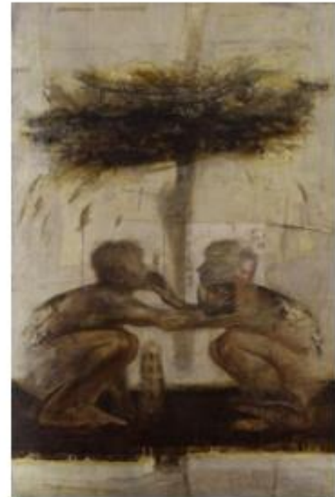
Ernesto Manera (b.1964) "Treehouse"; 2001 Mixed media on canvas 73 x 48" From: Hugs-Embraces and Grasps