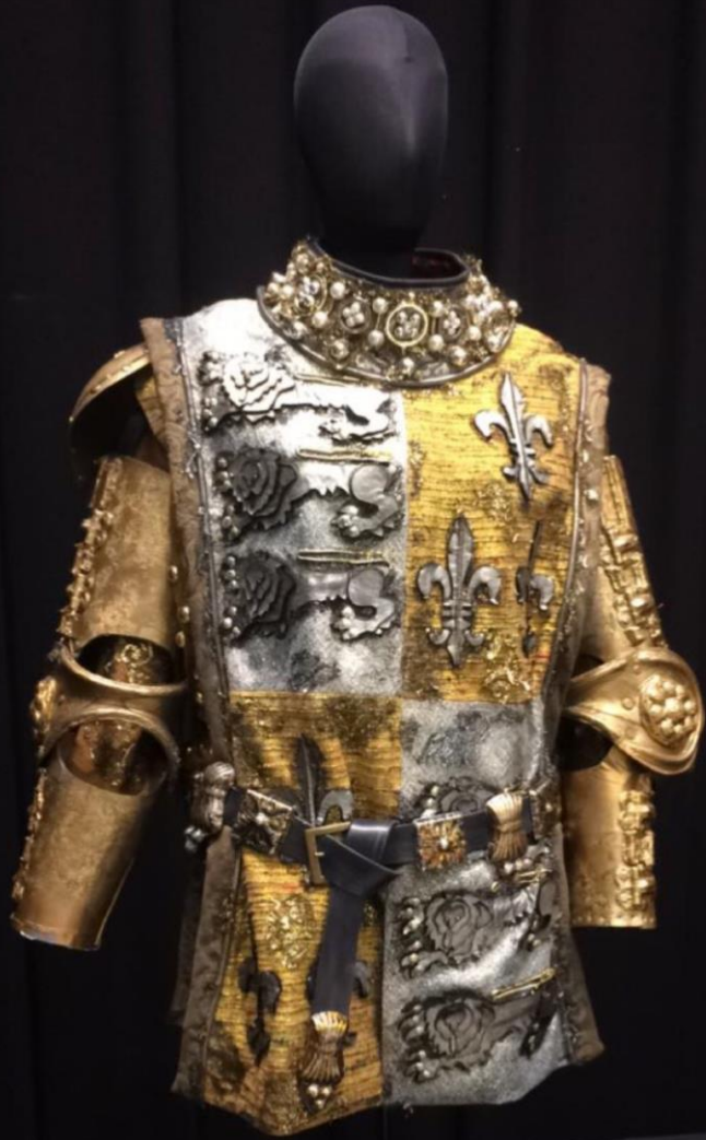
Tunic from Richard III (1964)