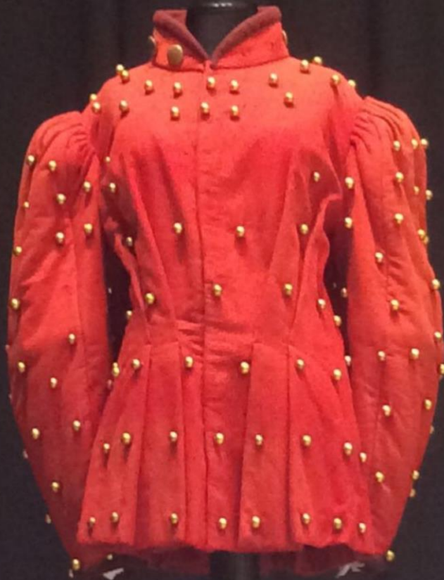
Doublet from Henry V (1956)