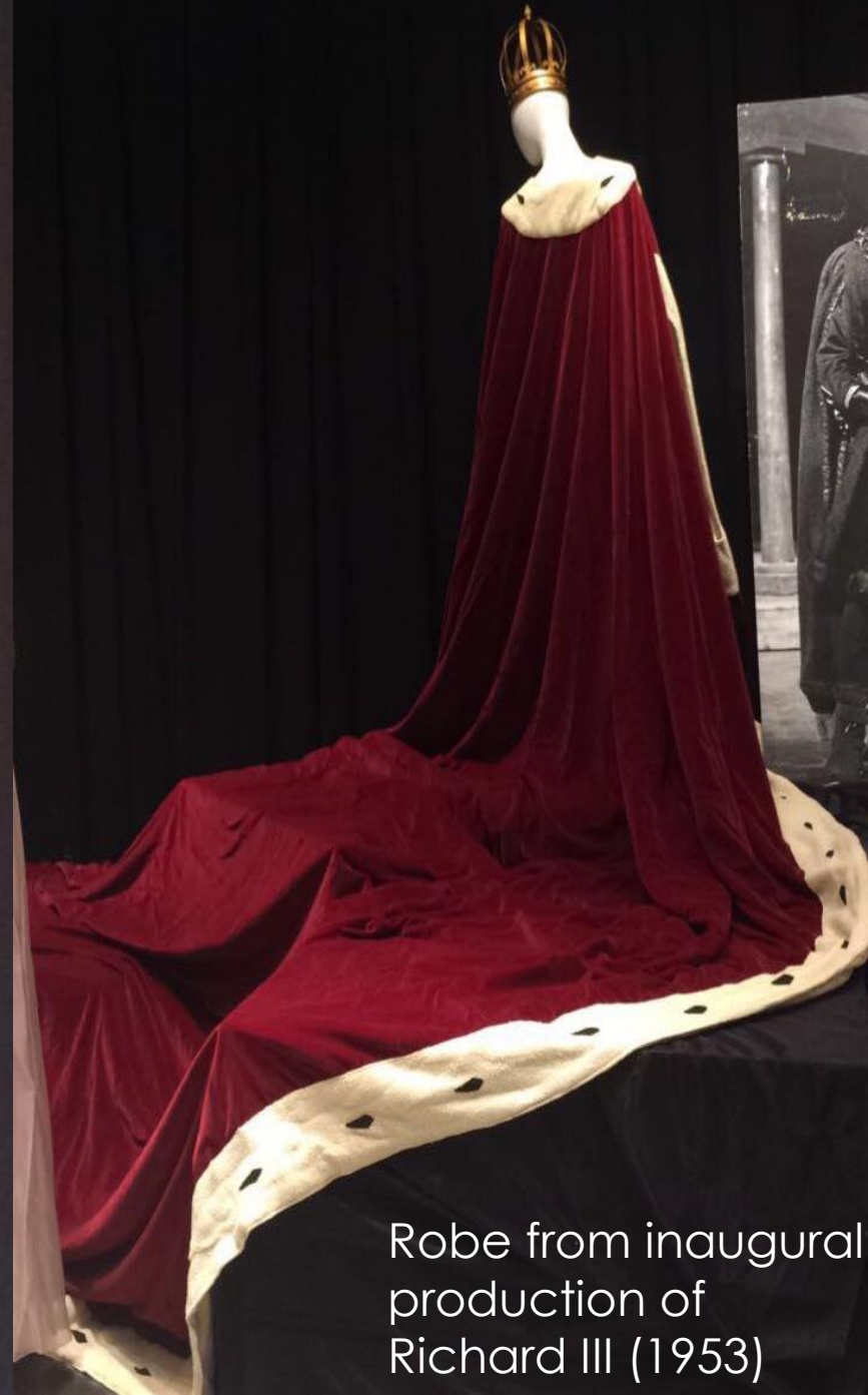
Robe from inaugural production of Richard III (1953)