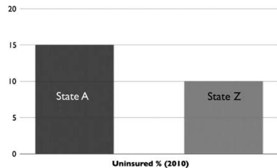
Figure 1 Example of a static graph.

Stock and flow maps are another tool of system thinkers. Stock and flow maps can depict a system in a common