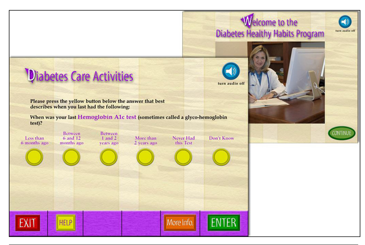
Fig 1 | User interface screens from Healthy Habits

MyPath to Healthy Life ( MyPath ) was a pragmatic trial [21] conducted at Kaiser Permanente Colorado with 463 adults with type 2 diabetes (Table 3.) Participants were randomized to one of three conditions: Healthy Habits; a web-based diabetes self-management support program ( MyPath ) that included online assistance for setting tailored goals for diet, physical activity, and medication taking; or the same web-based diabetes