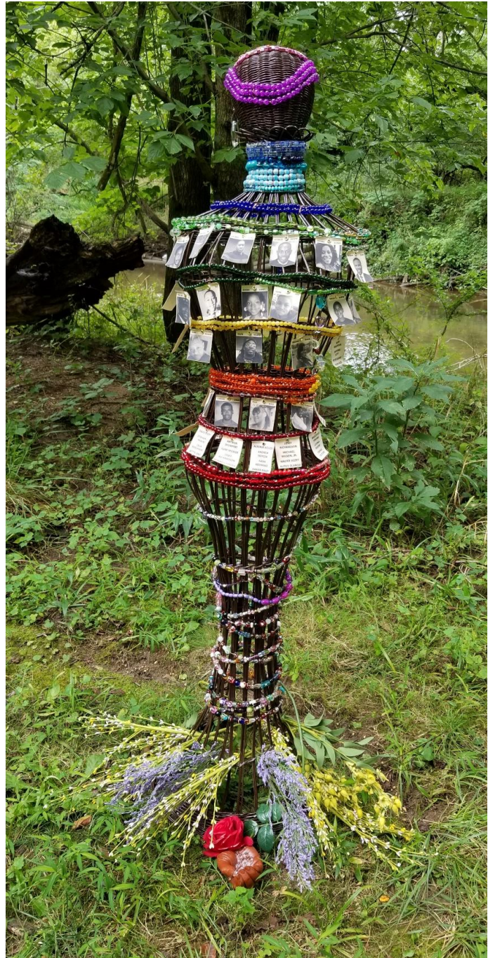
Top left: Installation concept design included in proposals to various sources. Bottom left: Beading process work-in-progress. Right: Completed center piece mounted Gwynnvale Park.