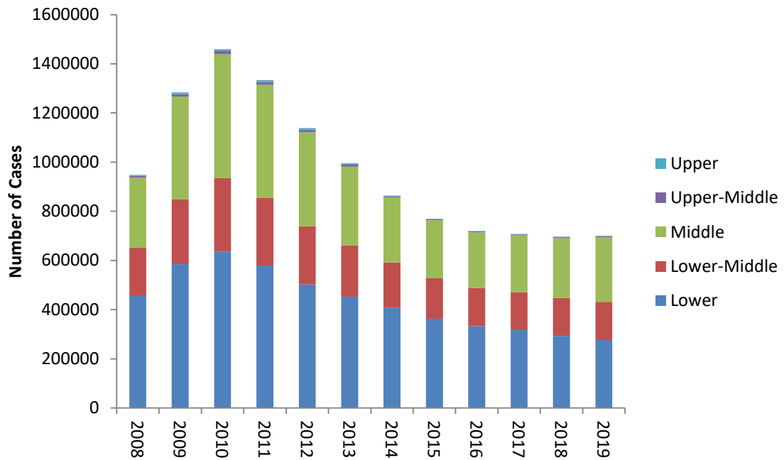
Figure 2: Yearly Bankruptcy Cases by Income Bracket

Note: Based on annual IDB data. Displays new bankruptcy filings only. Grouped by Pew 2014 income bracket definitions.