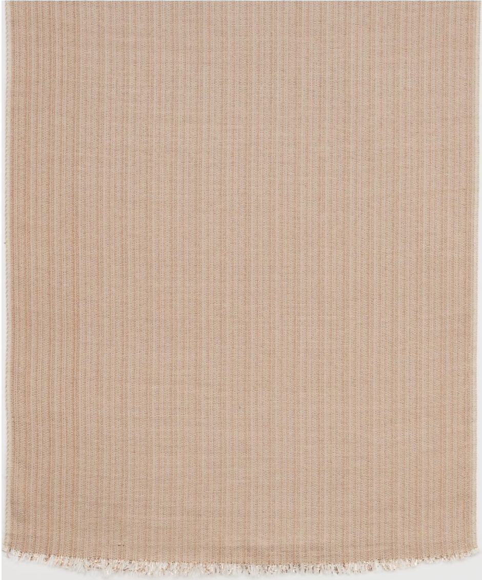
Figure Seven Anni Albers Drapery material (Used in the Rockefeller Guest House) 1942–1944 Lurex, cellophane, and cotton chenille 137 x 36" (348 x 91.4 cm) Gift of the designer 451.1975