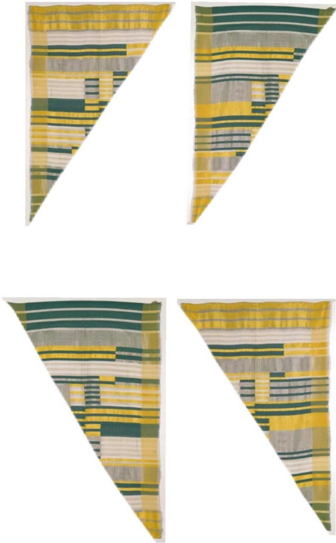
Figure Four Diagonally cut images of 1925 “Untitled Wall Hanging” Shows identical nature of design