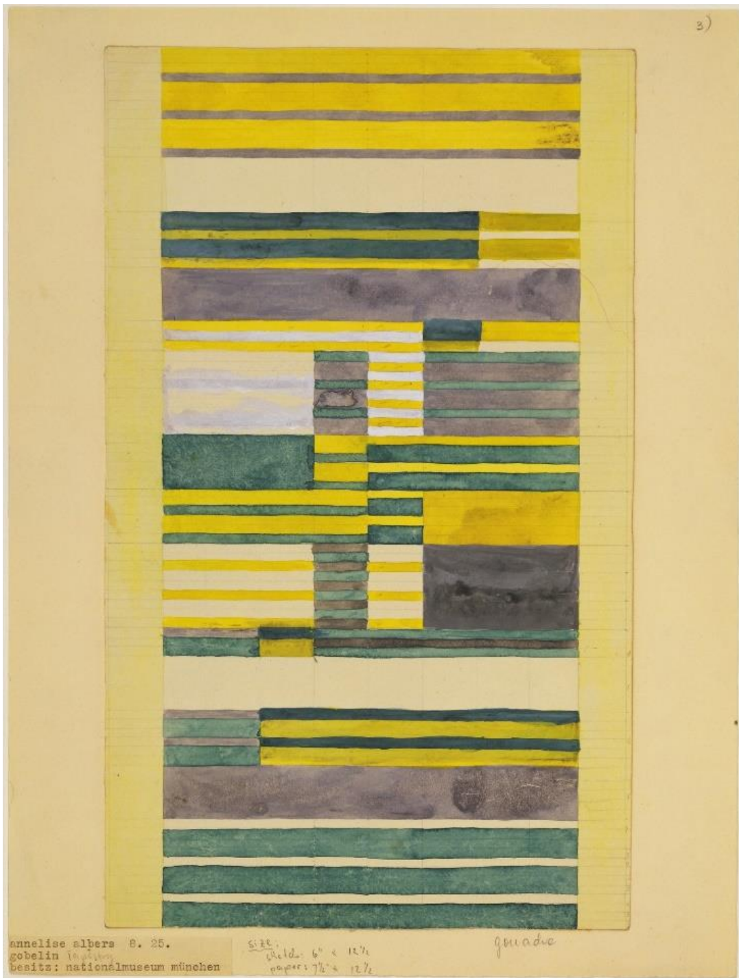
Figure Two Anni Albers Design for Wall Hanging, 1925 Guache, graphite 13 3/16 x 10 7/16" (33.5 x 26.5 cm) MoMa. gift of the designer, 395.1951