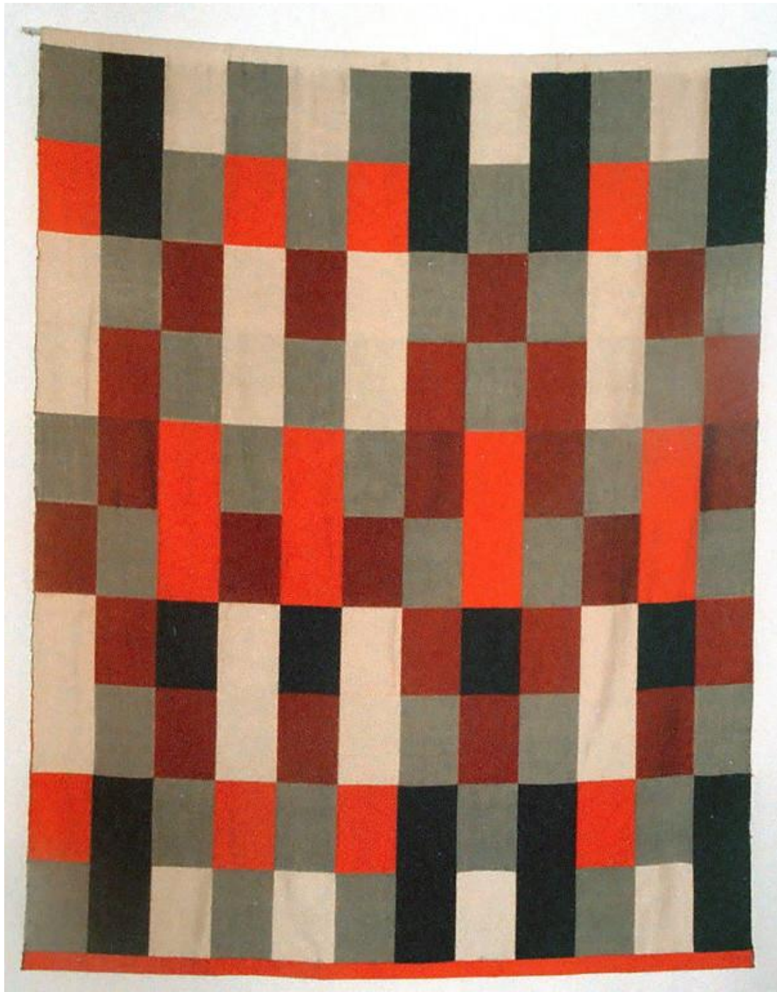
Figure Six Gunta Stölzl Double weave technique 1964 155 x 120 cm