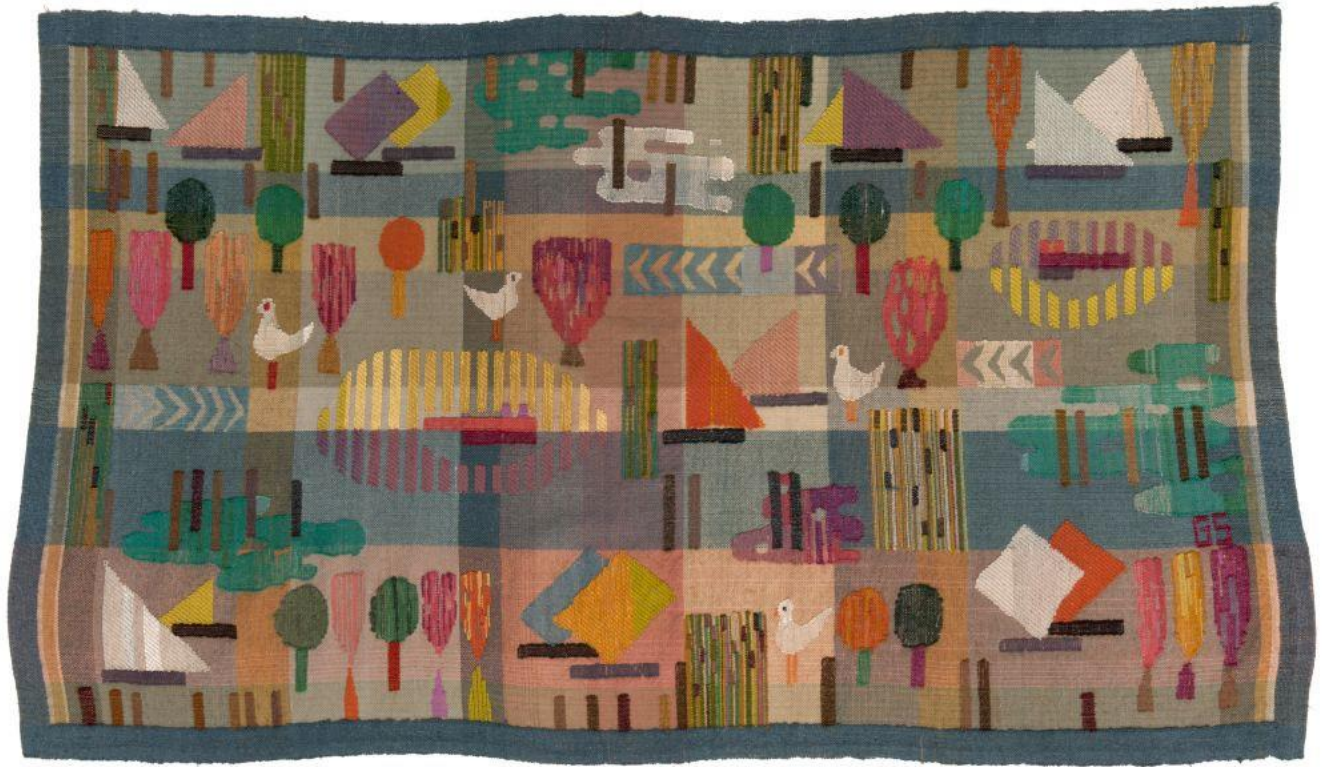
Figure Five Gunta Stölzl Semi gobelin technique 1952 100 x 180 cm