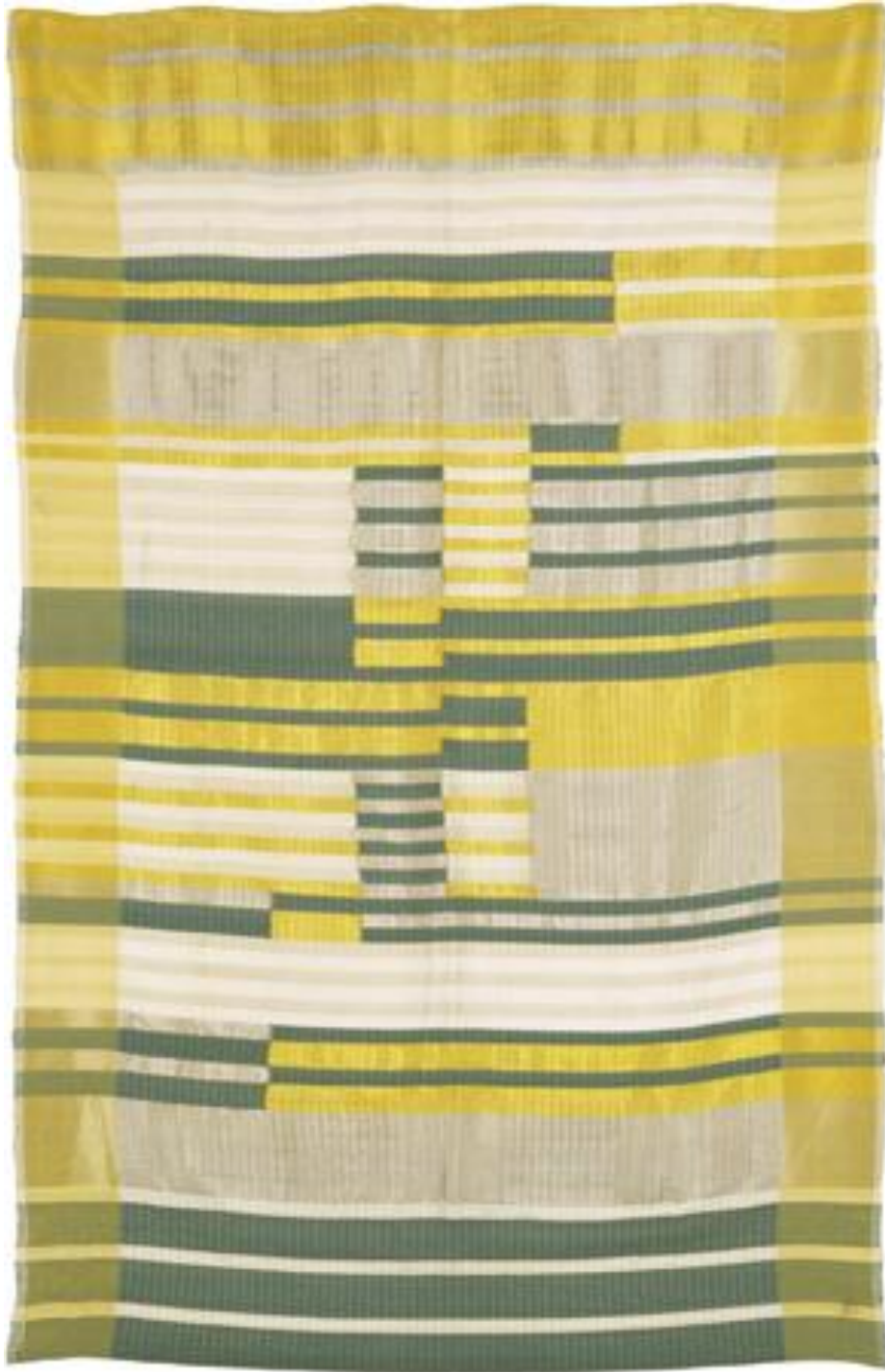
Figure Three Anni Albers Untitled Wall Hanging, 1925 Silk, cotton, acetate 50 × 38 in. (127 × 96.5 cm) Die Neue Sammlung, Munich 363.26