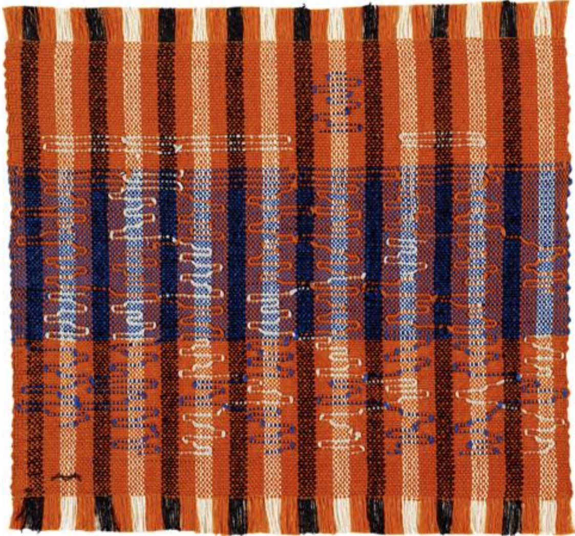
Figure Eight Anni Albers Intersecting, 1962 cotton and rayon 15.75 × 16.5 in. (40 × 41.9 cm) 1962. 12. 1