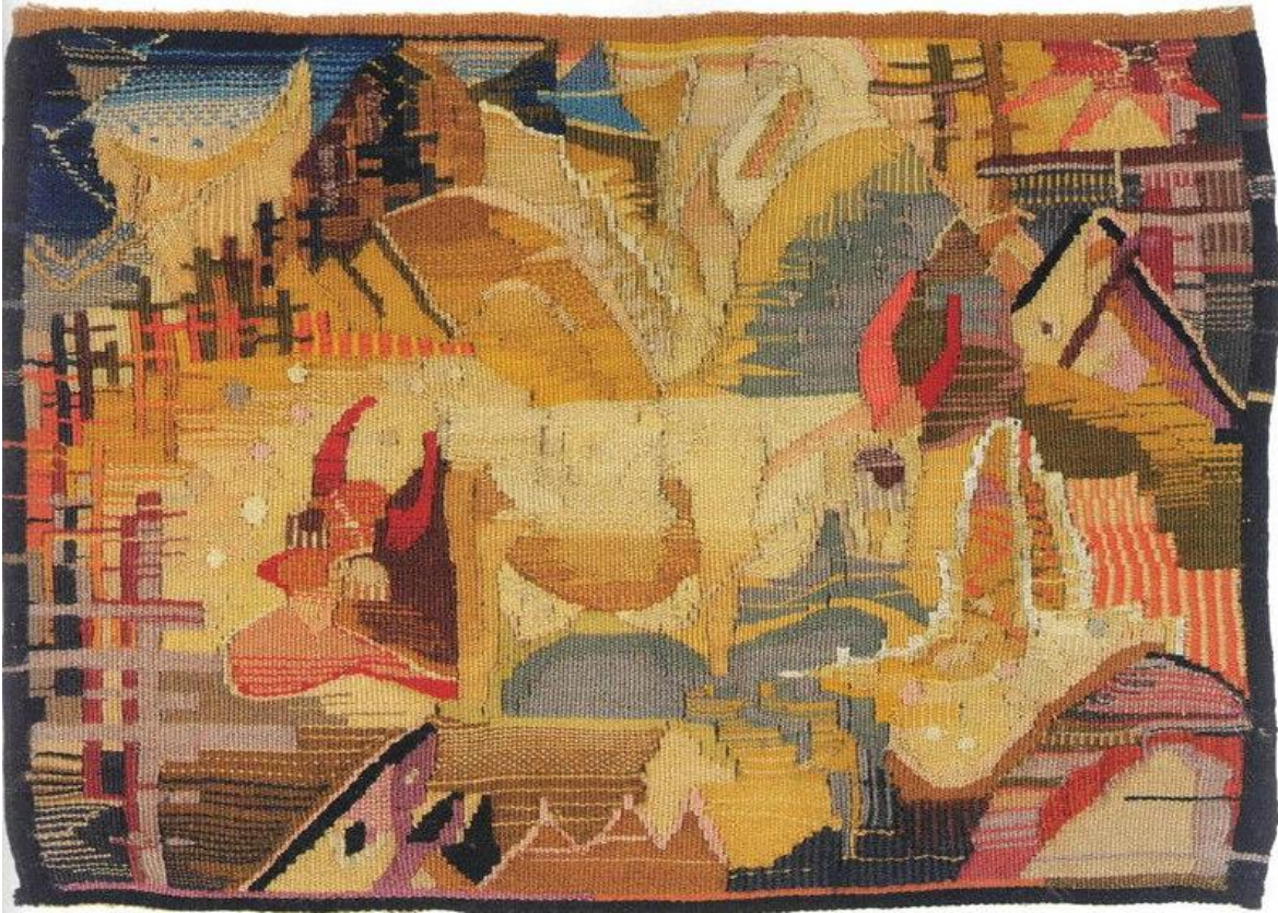
Figure One Gunta Stözl “Cows in Landscape” (“Kühe in Landschaft”), 1920 Gobelin technique, in part slit formation Warp: cotton. Weft: wool, fine mohair 30 x 50 cm