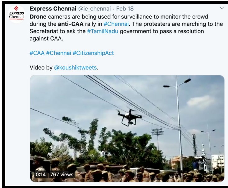
Figure 6: Drone surveillance used in Chennai during a protest of 20,000 on February 18th, 2020.