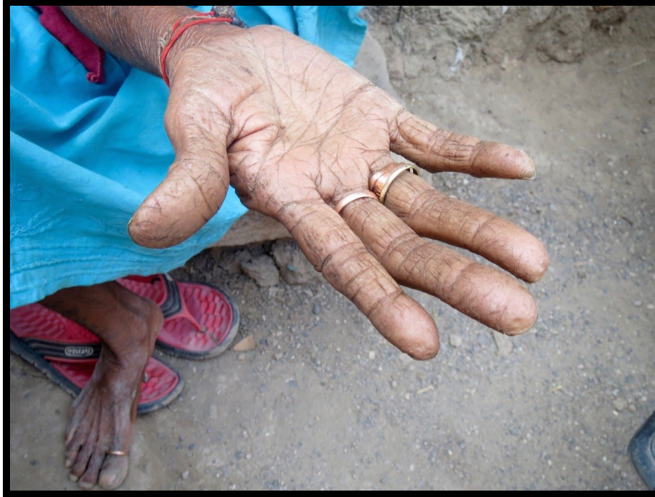
Figure 1: An old woman in Gujarat showed the cracked skin of her palms.