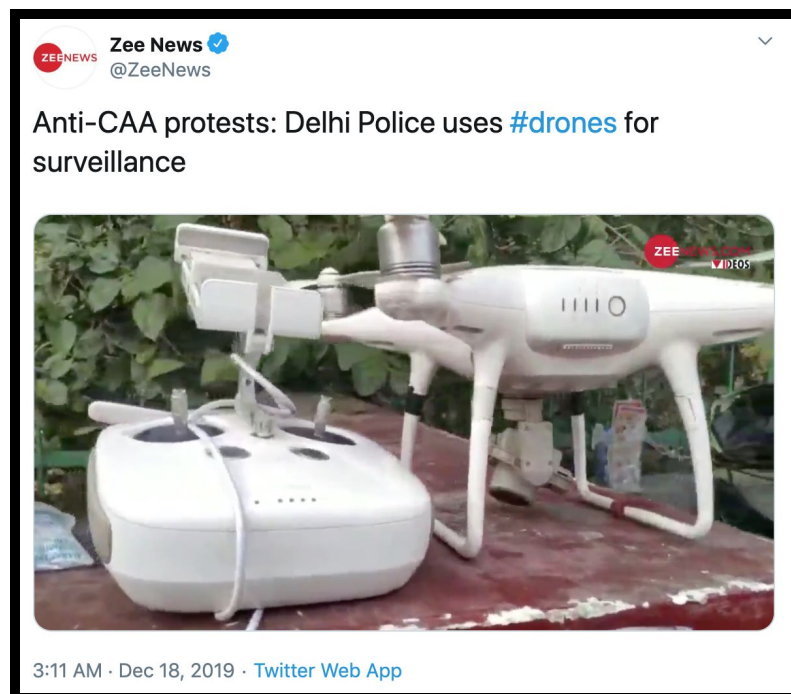
Figure 5: Documented usage of the DJI Phantom drone by the Delhi Police by Twitter account @ZeeNews.