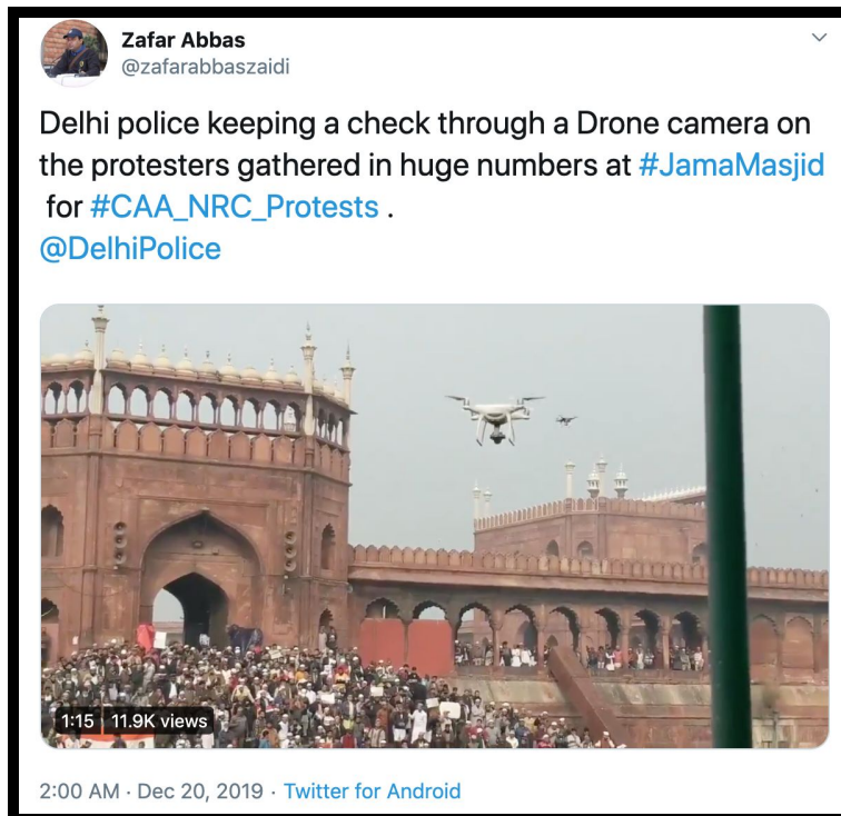
Figure 7: Drone surveillance used outside the Jama Masjid in New Delhi on December 20th captured by Twitter user @zafarabbaszaidi.